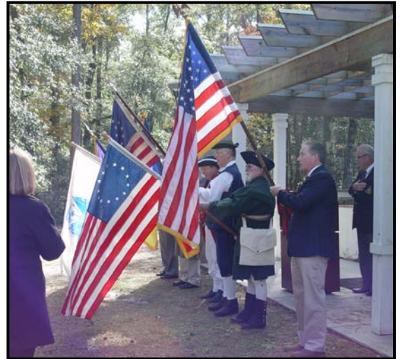
State Senator Greg Hembree led the Pledge of Allegiance prior to the posting of the colors.

Phase 2 of the restoration project should be started sometime in the spring of 2016.