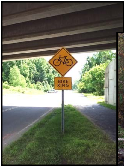
Signage was added for identification and safety .

With the completion of this trailhead project, two recreational trails have been connected, parking has been provided, and a staging area for events has been created. This project has created the first East Coast Greenway trailhead in Horry County. Cost of the project was $86,000.00. The grant accounted for $60,950 dollars with Horry County In-Kind costs and labor contributing $25,050 dollars.