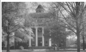
The Horry County Board of Architectural Review