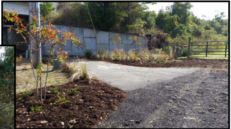
A last step was to add landscaping to provide an inviting look as well as to help identify the trailhead.