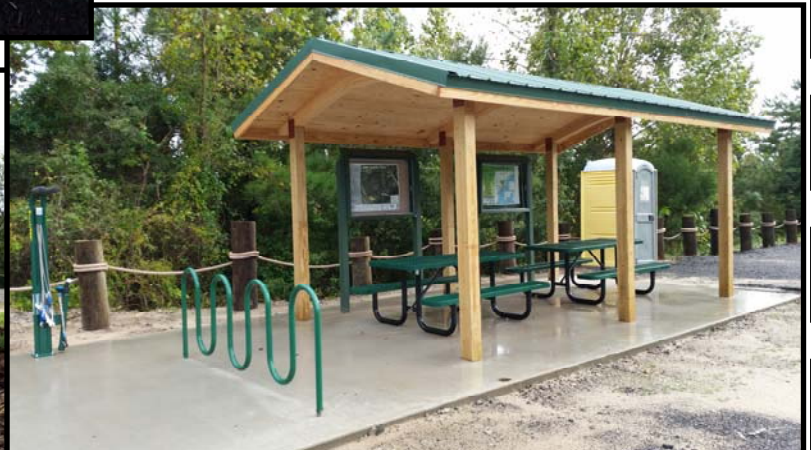
The Park and Trailhead sign is the first of its kind in Horry County. All other signs located in Horry County along the East Coast Greenway Trail will now be patterned off of this one.