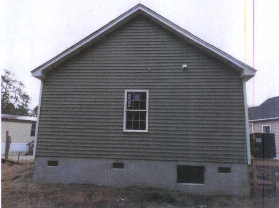
Photo Two Caption REAR VIEW