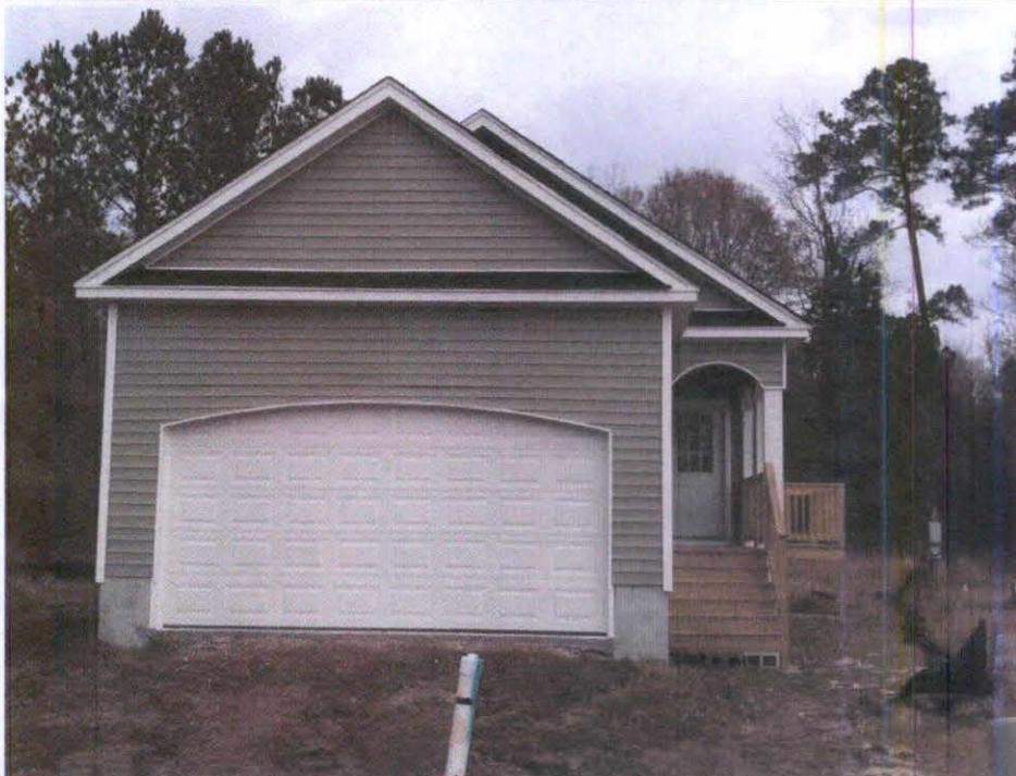
Photo One Caption FRONT VIEW

If using the Elevation Certificate to obtain NFIP flood insurance, affix at least 2 building photographs below according to the instructions for Item A6. Identify all photographs with date taken; "Front View" and "Rear View"; and, if required, "Right Side View" and "Left Side View." When applicable, photographs must show the foundation with representative examples of the flood openings or vents, as indicated in Section A8. If submitting more photographs than will fit on this page, use the Continuation Page.