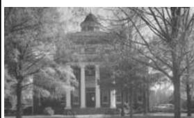
The Horry County Board of Architectural Review

Keep Horry County Beautiful has had a spectacular year with numerous beautification projects and over 40 cleanup events to boast about. Year-to-date, over 500 Keep Horry County Beautiful volunteers have cleaned up over 19,000 lbs of trash! Together, volunteer groups are helping to protect our County's natural beauty. This fall, KHCB is teaming up with the Waccamaw Riverkeeper and local Community Cleanup groups to pilot and establish a community service program for non-violent offenders involved in the Solicitor's Pretrial Intervention Program. KHCB is a subcommittee of the Parks and Open Space Board and is a local affiliate of Keep America Beautiful and Palmetto Pride. Volunteers are always welcomed to participate in our events and attend our board meetings. To learn more about this committee, visit the http://www.horrycounty.org/Boards/KeepHorryCountyBeautiful.aspx