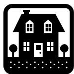
Horry County Affordable and Workforce Housing Commission

The Horry County Board of Architectural Review (BAR) & Historic Preservation is working with local Garden Clubs. Planning and Zoning, Horry County BAR & Historical Preservation have teamed up with local Garden Clubs on a county wide project. One thousand historic trees will each be named after a civil war soldier. This is to be done by attaching a QR code tag to each identified tree. At any tree location, a person can scan the tag with their phone and the life and history of the civil war soldier the tree has been named after, will be downloaded onto the users phone. This is a way to combine local history with the 21st century user. (Not to mention the preservation of historic trees.) As of yet the project does not have an official name but the Garden Clubs are working on it.