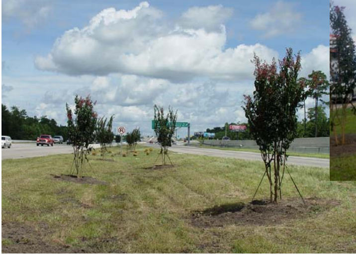
Improvements run from Rhoda Loop to Waccamaw Pines Drive.