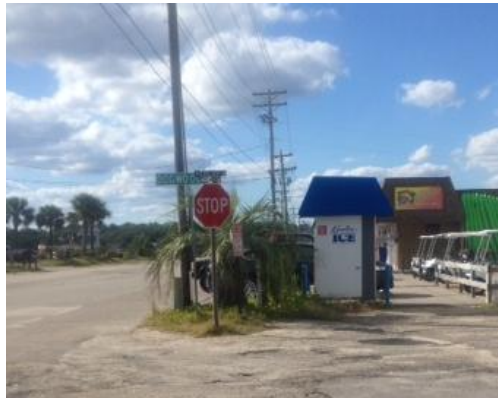
This illegally placed ice machine is too close to two streets and has the potential to cause a stoppage in traffic when someone leaves their car on the street and walks over to get ice.