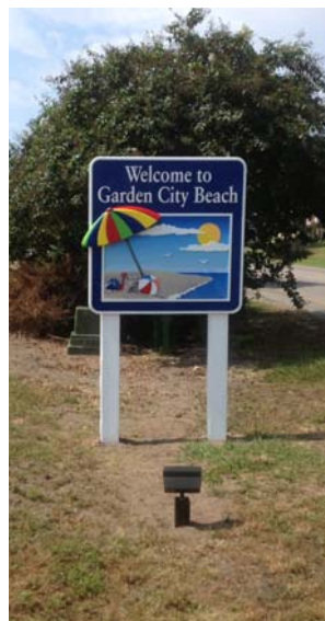
The last piece of this project was put into place with the installation of two "Welcome to Garden City Beach" signs on US 17, placed north and south of the city.