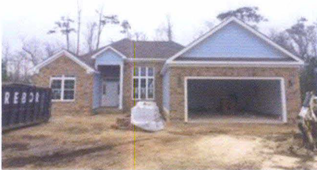
Front View (01-06-16)

If using the Elevation Certificate to obtain NFIP flood insurance, affix at least 2 building photographs below according to the instructions for Item A6. Identify all photographs with date taken; "Front View" and "Rear View"; and, if required, "Right Side View" and "Left Side View." When applicable, photographs must show the foundation with representative examples of the flood openings or vents, as indicated in Section A8. If submitting more photographs than will fit on this page, use the Continuation Page.