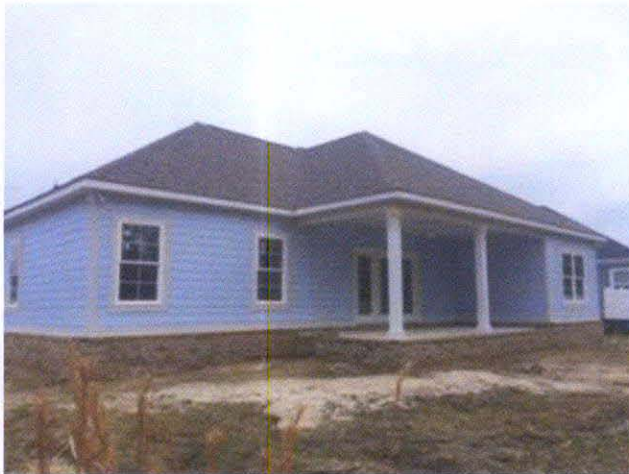
Rear View (01-06-16)