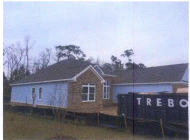
Left Side View (01-06-16)