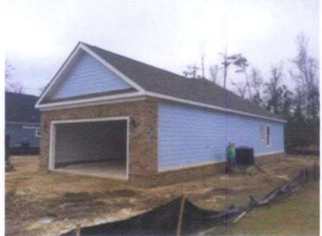
Right Side View (01-06-16)