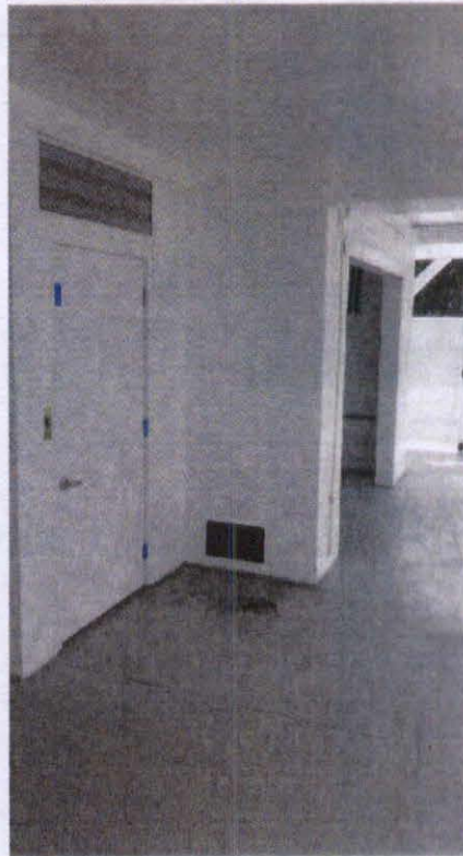
VENT VIEW ADDED SEPT. 8, 2015

If submitting more photographs than will fit on the preceding page, affix the additional photographs below. Identify all photographs with: date taken; "Front View" and "Rear View"; and, if required, "Right Side View" and "Left Side View." When applicable, photographs must show the foundation with representative examples of the flood openings or vents, as indicated in Section A8.