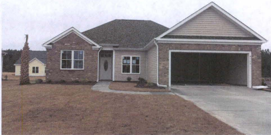
Front View 02-23-15

If using the Elevation Certificate to obtain NFIP flood insurance, affix at least 2 building photographs below according to the instructions for Item A6. Identify all photographs with date taken; "Front View" and "Rear View"; and, if required, "Right Side View" and "Left Side View." When applicable, photographs must show the foundation with representative examples of the flood openings or vents, as indicated in Section A8. If submitting more photographs than will fit on this page, use the Continuation Page.