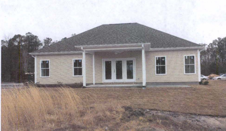
Rear View 02-23-15