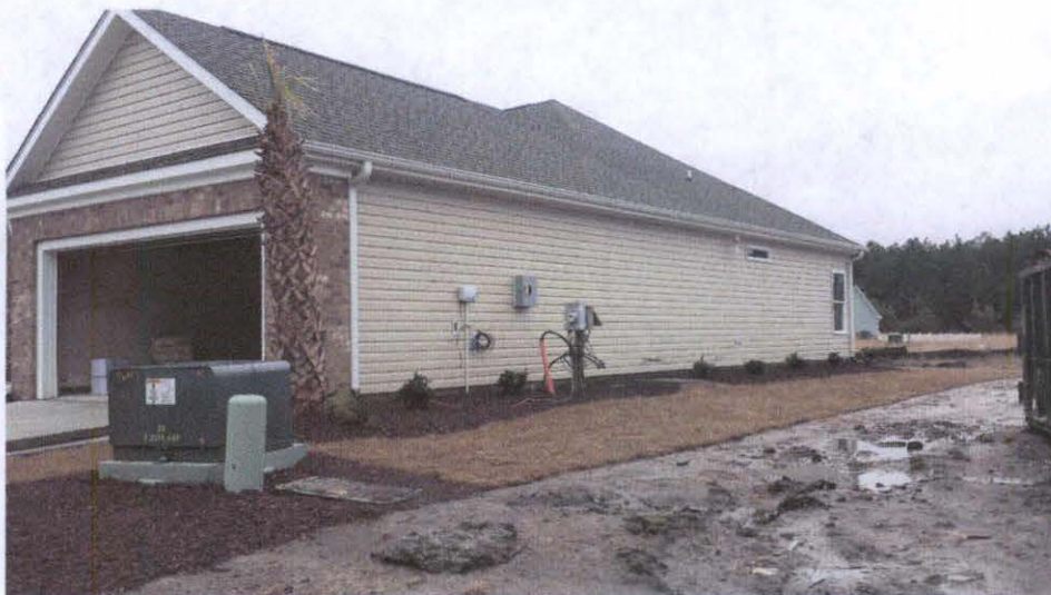
Right View 02-23-15