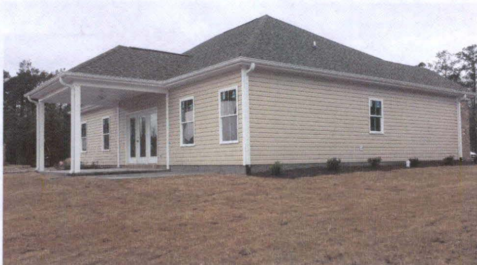
Left View 02-23-15