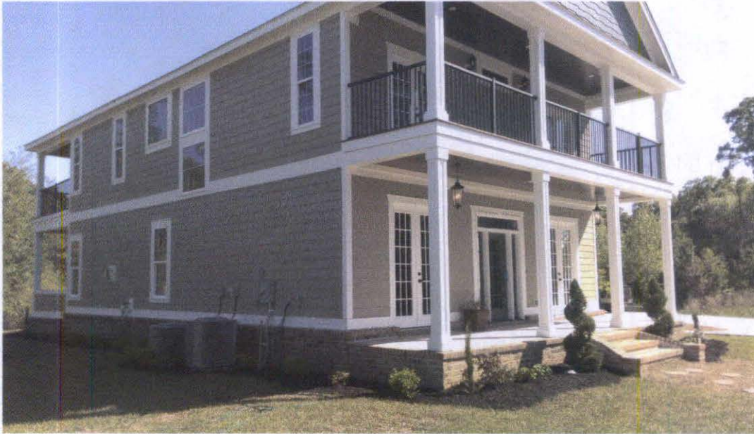
Left, Front View April 18, 2016

If using the Elevation Certificate to obtain NFIP flood insurance, affix at least 2 building photographs below according to the instructions for Item A6. Identify all photographs with date taken; "Front View" and "Rear View"; and, if required, "Right Side View" and "Left Side View." When applicable, photographs must show the foundation with representative examples of the flood openings or vents, as indicated in Section A8. If submitting more photographs than will fit on this page, use the Continuation Page.