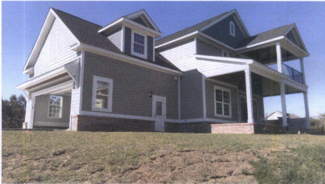
Right, Rear View April 18, 2016