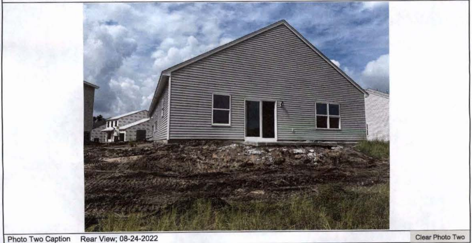
Replaces all previous editions.