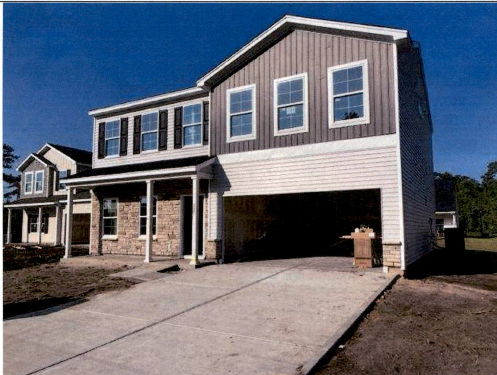
Photo One Caption Front View; 06-05-2023

If using the Elevation Certificate to obtain NFIP flood insurance, affix at least 2 building photographs below according to the instructions for Item A6. Identify all photographs with date taken; "Front View" and "Rear View"; and, if required, "Right Side View" and "Left Side View." When applicable, photographs must show the foundation with representative examples of the flood openings or vents, as indicated in Section A8. If submitting more photographs than will fit on this page, use the Continuation Page.