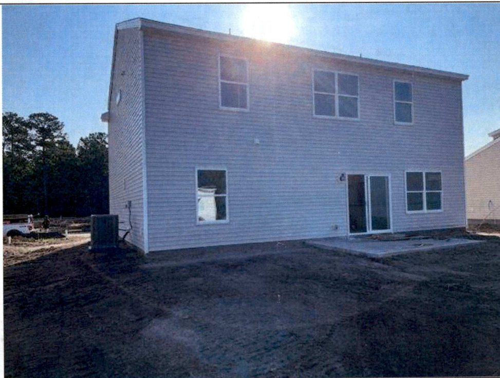
Photo Two Caption Rear View; 06-05-2023