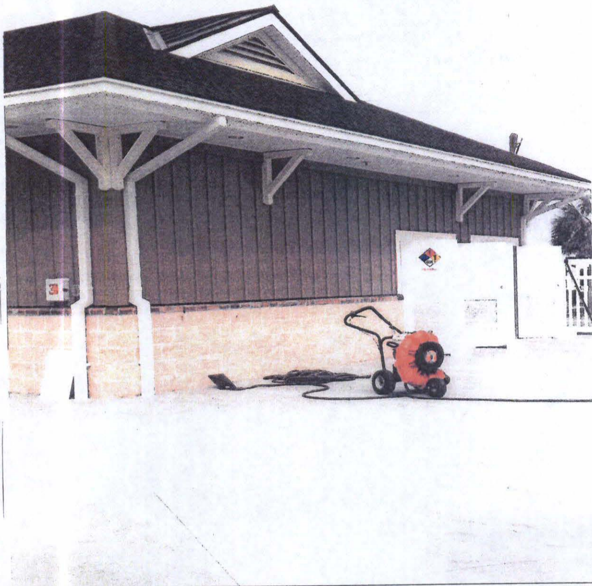
Building Front May 2, 2016

If using the Elevation Certificate to obtain NFIP flood insurance, affix at least 2 building photographs below according to the instructions for Item A6. Identify all photographs with date taken; "Front view" and "Rear view"; and, if required, "Right Side View" and "Left Side View." When applicable, photographs must show the foundation with representative examples of the flood openings or vents, as indicated in Section A8. If submitting more photographs than will fit on this page, use the Continuation Page.