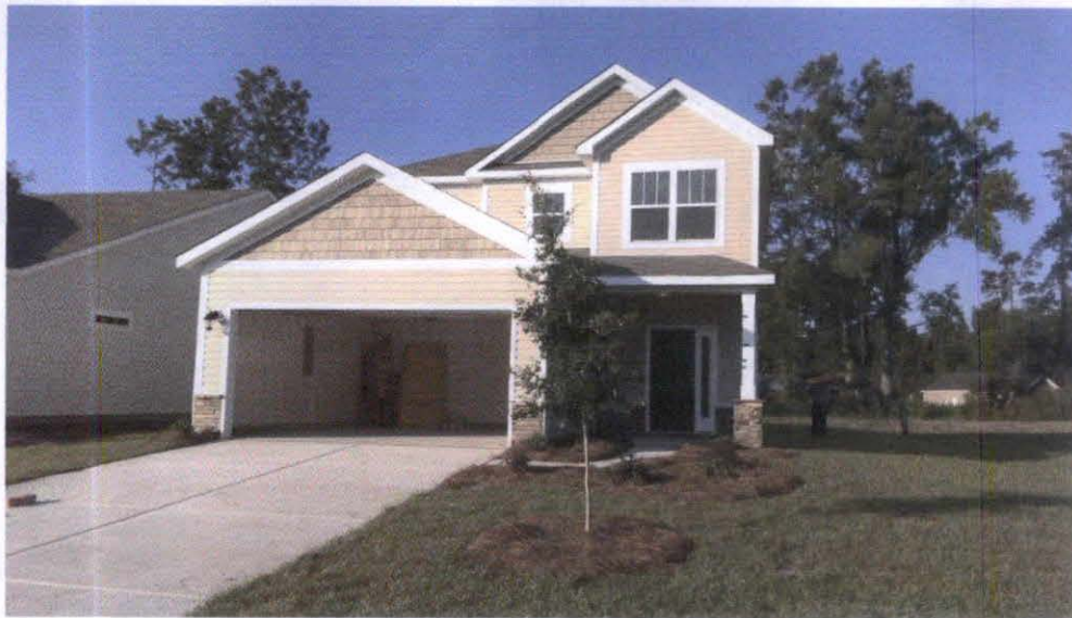
Front View June 22, 2014

If using the Elevation Certificate to obtain NFIP flood insurance, affix at least 2 building photographs below according to the instructions for Item A6. Identify all photographs with date taken; "Front View" and "Rear View"; and, if required, "Right Side View" and "Left Side View." When applicable, photographs must show the foundation with representative examples of the flood openings or vents, as indicated in Section A8. If submitting more photographs than will fit on this page, use the Continuation Page.