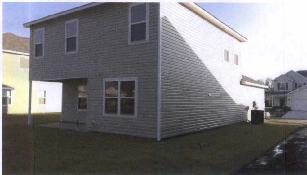
Rear View June 22, 2014