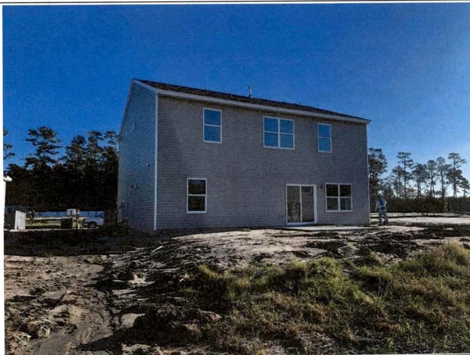
Photo Two Caption Rear View; 11-28-2022