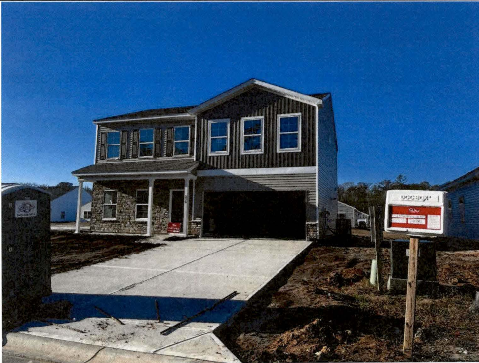
Photo One Caption Front View; 11-28-2022

If using the Elevation Certificate to obtain NFIP flood insurance, affix at least 2 building photographs below according to the instructions for Item A6. Identify all photographs with date taken; "Front View" and "Rear View"; and, if required, "Right Side View" and "Left Side View." When applicable, photographs must show the foundation with representative examples of the flood openings or vents, as indicated in Section A8. If submitting more photographs than will fit on this page, use the Continuation Page.