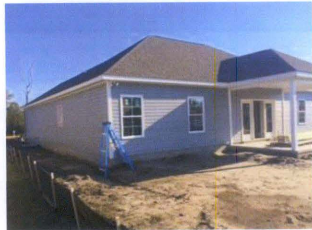
Right Side View (12/10/15)