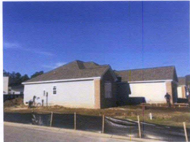
Left Side View (12/10/15)