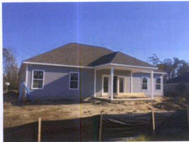
Rear View (12/10/15)