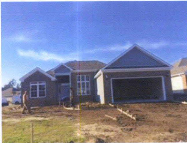
Front View (12/10/15)

If using the Elevation Certificate to obtain NFIP flood insurance, affix at least 2 building photographs below according to the instructions for Item A6. Identify all photographs with date taken; "Front View" and "Rear View"; and, if required, "Right Side View" and "Left Side View." When applicable, photographs must show the foundation with representative examples of the flood openings or vents, as indicated in Section A8. If submitting more photographs than will fit on this page, use the Continuation Page.