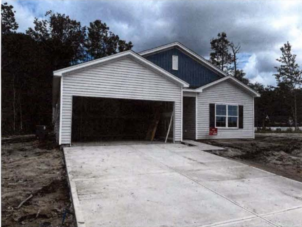
Photo One Caption Front View; 08-29-2022

If using the Elevation Certificate to obtain NFIP flood insurance, affix at least 2 building photographs below according to the instructions for Item A6. Identify all photographs with date taken; "Front View" and "Rear View"; and, if required, "Right Side View" and "Left Side View." When applicable, photographs must show the foundation with representative examples of the flood openings or vents, as indicated in Section A8. If submitting more photographs than will fit on this page, use the Continuation Page.