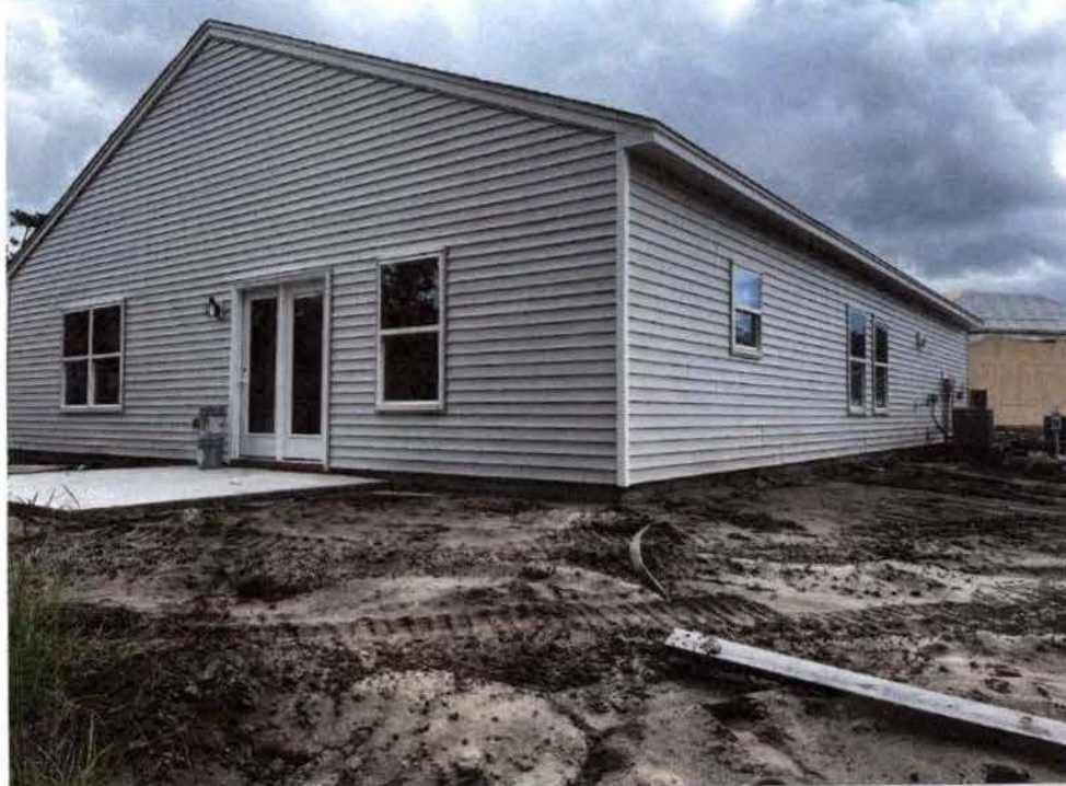
Photo Two Caption Rear View; 08-29-2022