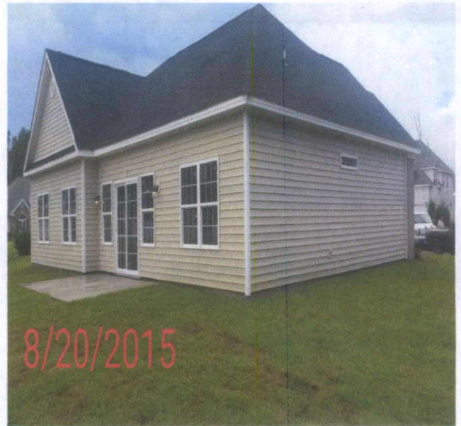
Left side REAR