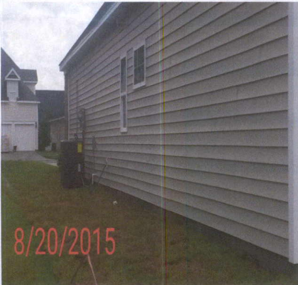
Right side HVAC