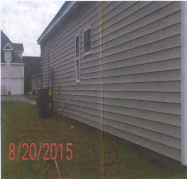
Right side HVAC