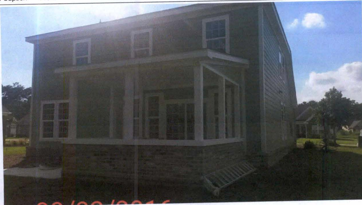
Photo One Caption Front