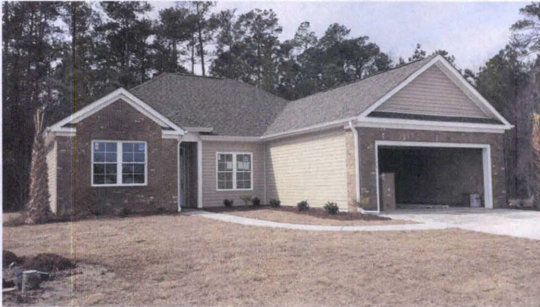
Front View 02/27/15

If using the Elevation Certificate to obtain NFIP flood insurance, affix at least 2 building photographs below according to the instructions for Item A6. Identify all photographs with date taken; "Front View" and "Rear View"; and, if required, "Right Side View" and "Left Side View." When applicable, photographs must show the foundation with representative examples of the flood openings or vents, as indicated in Section A8. If submitting more photographs than will fit on this page, use the Continuation Page.