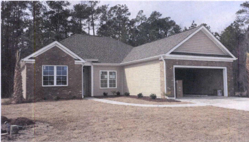
Front View 02/27/15

If using the Elevation Certificate to obtain NFIP flood insurance, affix at least 2 building photographs below according to the instructions for Item A6. Identify all photographs with date taken; "Front View" and "Rear View"; and, if required, "Right Side View" and "Left Side View." When applicable, photographs must show the foundation with representative examples of the flood openings or vents, as indicated in Section A8. If submitting more photographs than will fit on this page, use the Continuation Page.