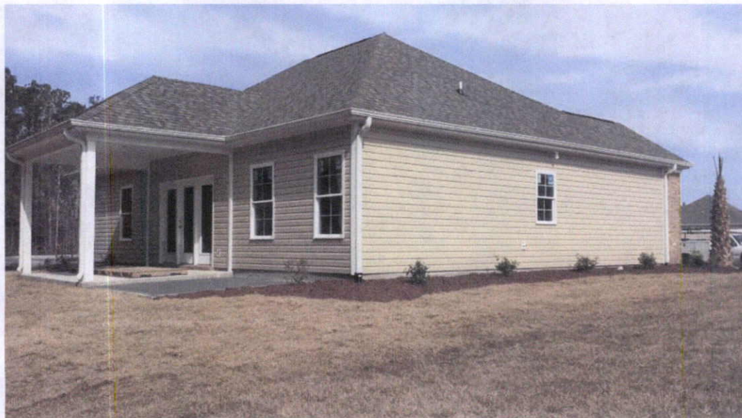
Left Side View 02/27/15