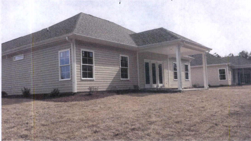
Rear View 02/27/15