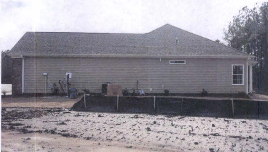
Right Side View 02/27/15