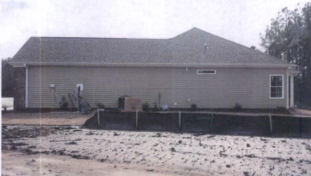
Right Side View 02/27/15