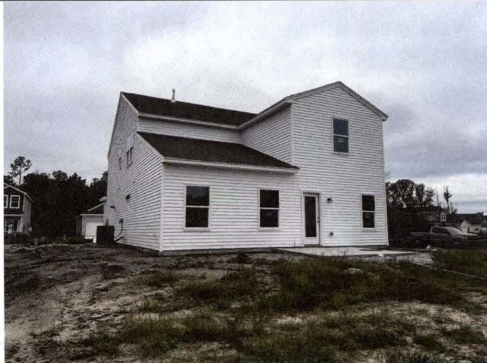
Photo Two Caption Rear View; 10-03-2022