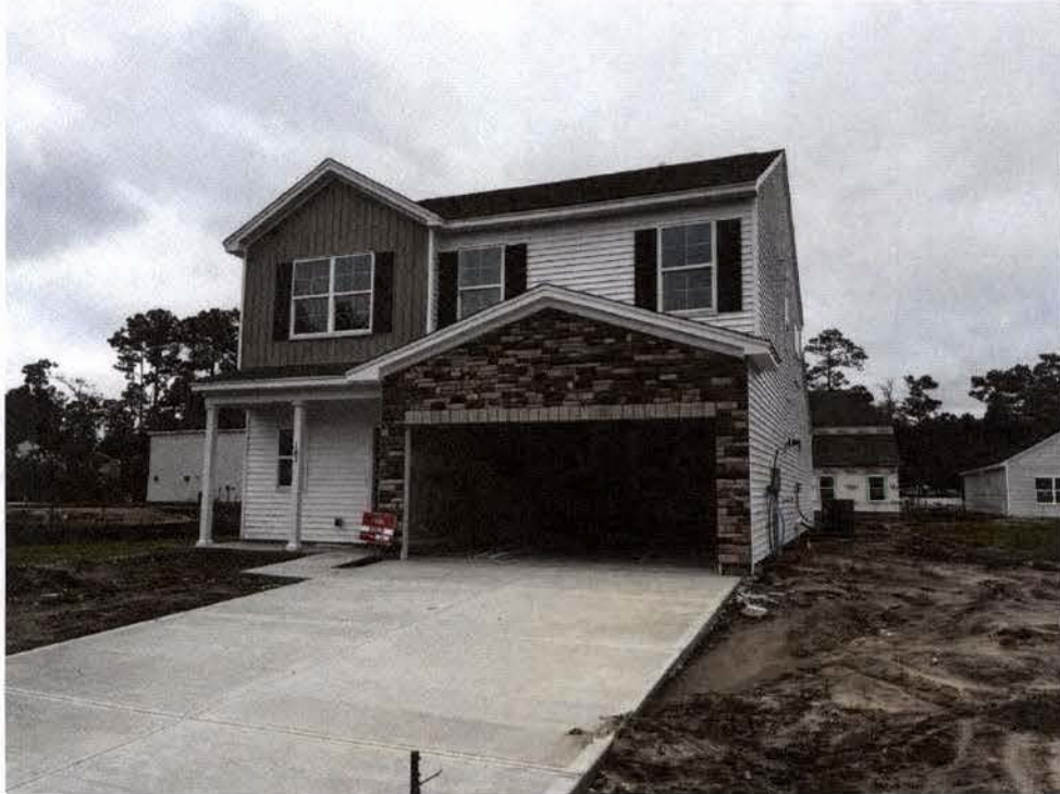
Photo One Caption Front View; 10-03-2022

If using the Elevation Certificate to obtain NFIP flood insurance, affix at least 2 building photographs below according to the instructions for Item A6. Identify all photographs with date taken; "Front View" and "Rear View"; and, if required, "Right Side View" and "Left Side View." When applicable, photographs must show the foundation with representative examples of the flood openings or vents, as indicated in Section A8. If submitting more photographs than will fit on this page, use the Continuation Page.