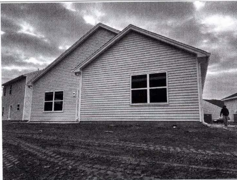
Photo Two Caption Rear View; 11-22-2022