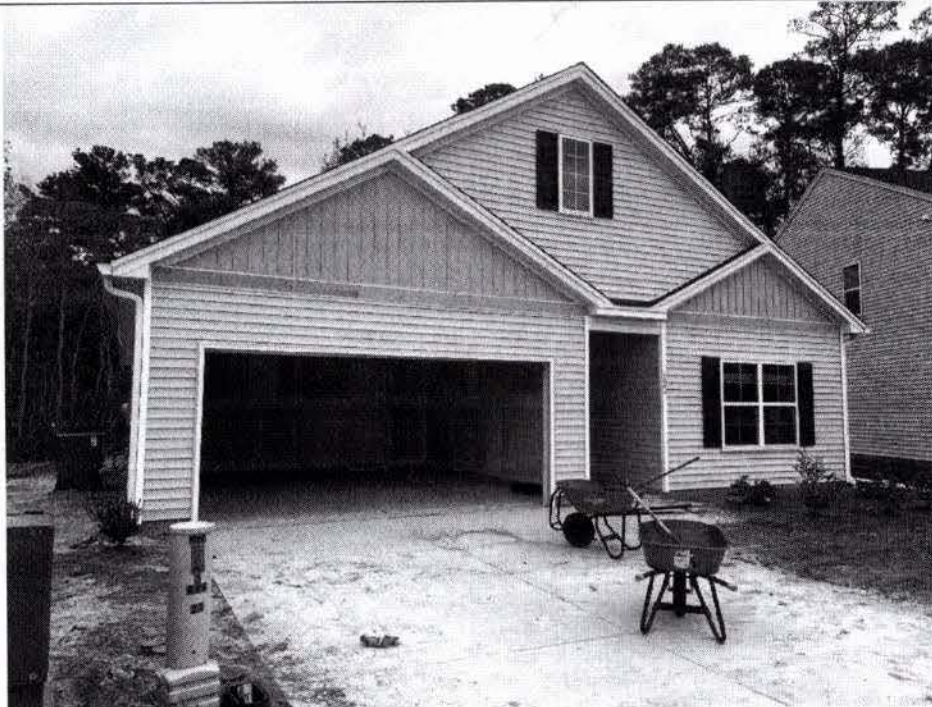
Photo One Caption Front View; 11-22-2022

If using the Elevation Certificate to obtain NFIP flood insurance, affix at least 2 building photographs below according to the instructions for Item A6. Identify all photographs with date taken; "Front View" and "Rear View"; and, if required, "Right Side View" and "Left Side View." When applicable, photographs must show the foundation with representative examples of the flood openings or vents, as indicated in Section A8. If submitting more photographs than will fit on this page, use the Continuation Page.