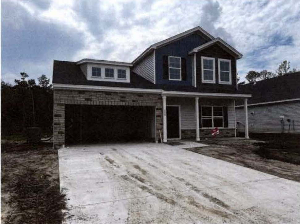
Photo One Caption Front View; 08-24-2022

If using the Elevation Certificate to obtain NFIP flood insurance, affix at least 2 building photographs below according to the instructions for Item A6. Identify all photographs with date taken; "Front View" and "Rear View"; and, if required, "Right Side View" and "Left Side View." When applicable, photographs must show the foundation with representative examples of the flood openings or vents, as indicated in Section A8. If submitting more photographs than will fit on this page, use the Continuation Page.