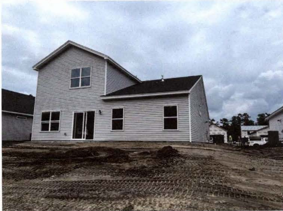
Photo Two Caption Rear View; 08-24-2022