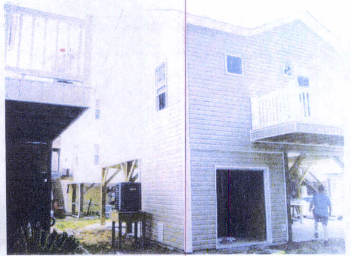
Rear View (6-03-16)