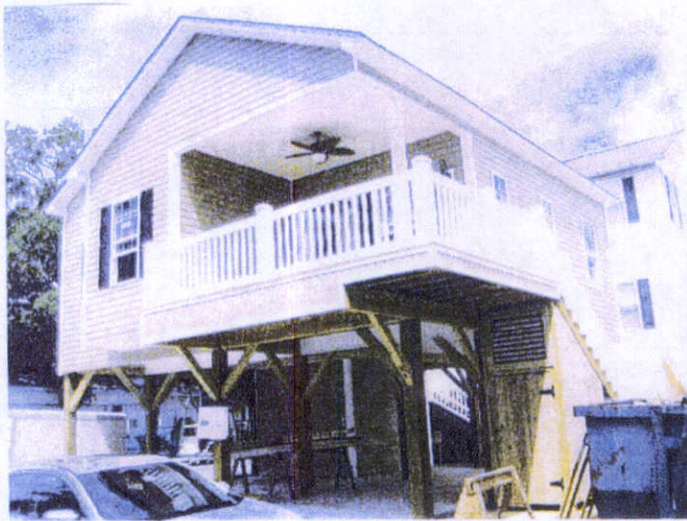
Front View (6-03-16)

If using the Elevation Certificate to obtain NFIP flood insurance, affix at least 2 building photographs below according to the instructions for Item A6. Identify all photographs with date taken; "Front view" and Rear view"; and, if required, "Right Side View" and "Left Side View." When applicable, photographs must show the foundation with representative examples of the flood openings or vents, as indicated in Section A8. If submitting more photographs than will fit on this page, use the Continuation Page.