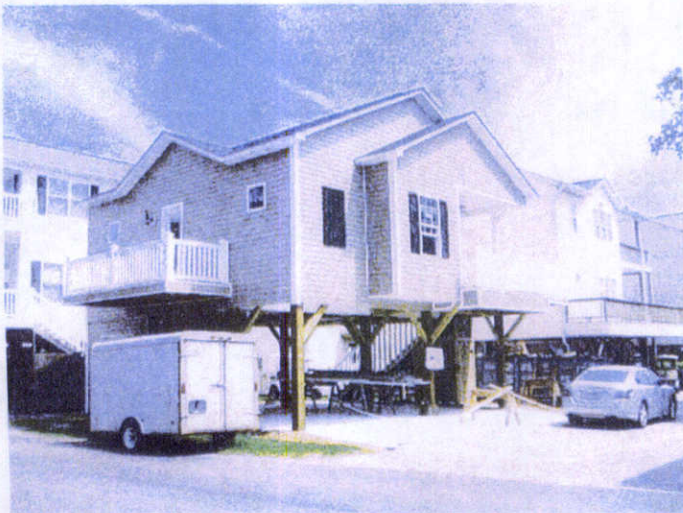
Left Side View (6-03-16)