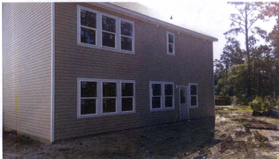
Rear View May 28, 2015