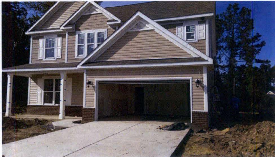
Front View May 28, 2015

If using the Elevation Certificate to obtain NFIP flood insurance, affix at least 2 building photographs below according to the instructions for Item A6. Identify all photographs with date taken; "Front View" and "Rear View"; and, if required, "Right Side View" and "Left Side View." When applicable, photographs must show the foundation with representative examples of the flood openings or vents, as indicated in Section A8. If submitting more photographs than will fit on this page, use the Continuation Page.