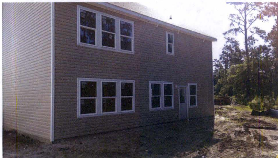
Rear View May 28, 2015