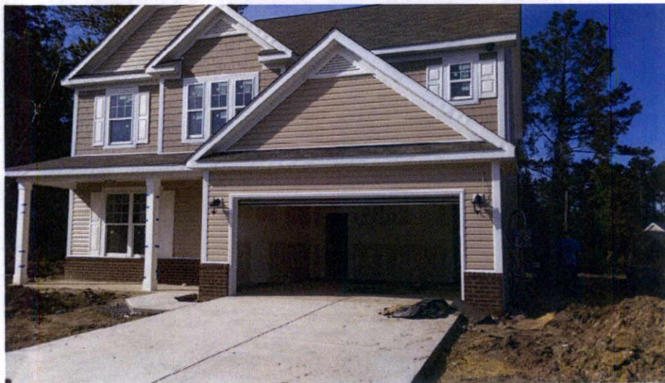
Front View May 28, 2015

If using the Elevation Certificate to obtain NFIP flood insurance, affix at least 2 building photographs below according to the instructions for Item A6. Identify all photographs with date taken; "Front View" and "Rear View"; and, if required, "Right Side View" and "Left Side View." When applicable, photographs must show the foundation with representative examples of the flood openings or vents, as indicated in Section A8. If submitting more photographs than will fit on this page, use the Continuation Page.