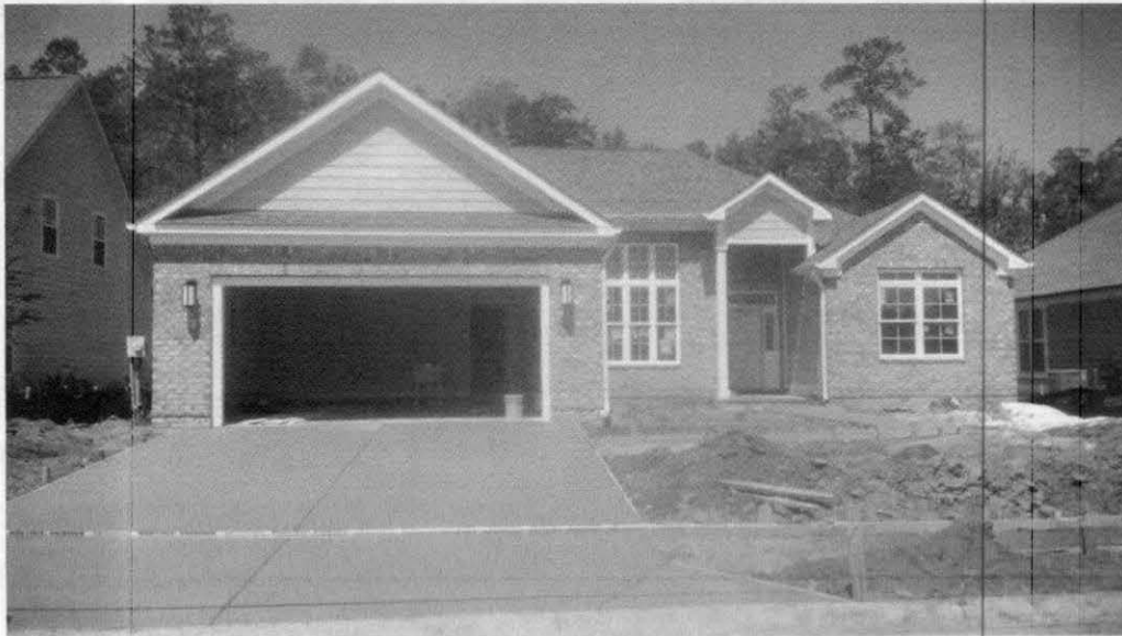
Front View (04/29/16)

If using the Elevation Certificate to obtain NFIP flood insurance, affix at least 2 building photographs below according to the instructions for Item A6. Identify all photographs with date taken; "Front View" and "Rear View"; and, if required, "Right Side View" and "Left Side View." When applicable, photographs must show the foundation with representative examples of the flood openings or vents, as indicated in Section A8. If submitting more photographs than will fit on this page, use the Continuation Page.