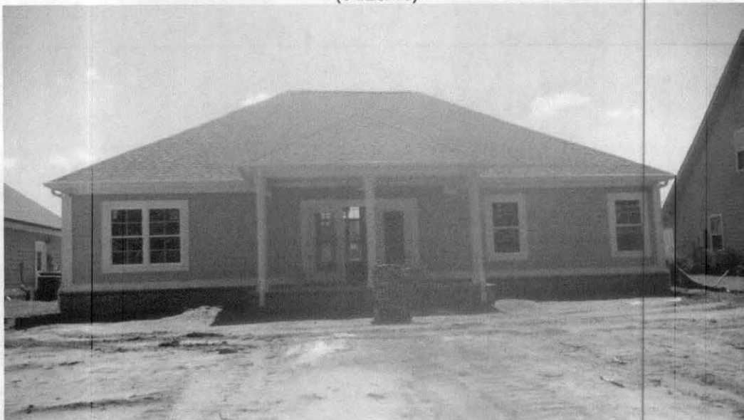
Rear View (04/29/16)