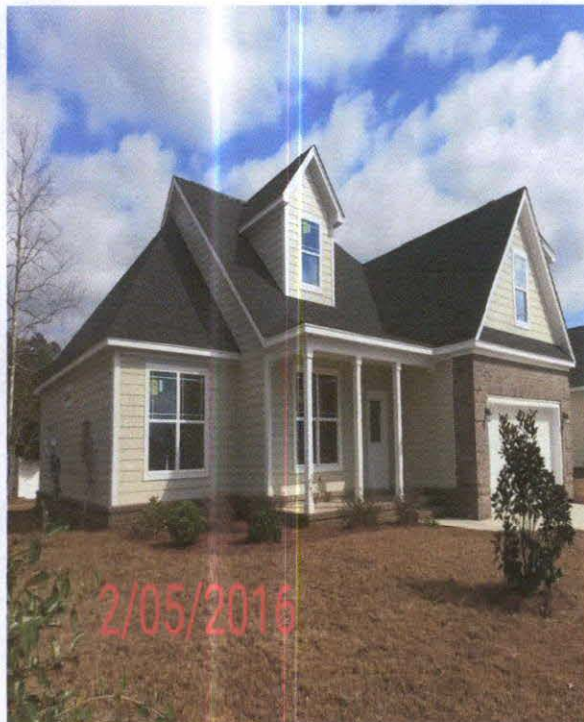
Front Left side

If using the Elevation Certificate to obtain NFIP flood insurance, affix at least 2 building photographs below according to the instructions for Item A6. Identify all photographs with date taken; "Front View" and "Rear View"; and, if required, "Right Side View" and "Left Side View." When applicable, photographs must show the foundation with representative examples of the flood openings or vents, as indicated in Section A8. If submitting more photographs than will fit on this page, use the Continuation Page.