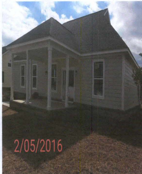
Rear Left side