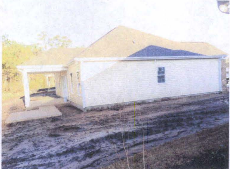
Left Side View 01/21/15