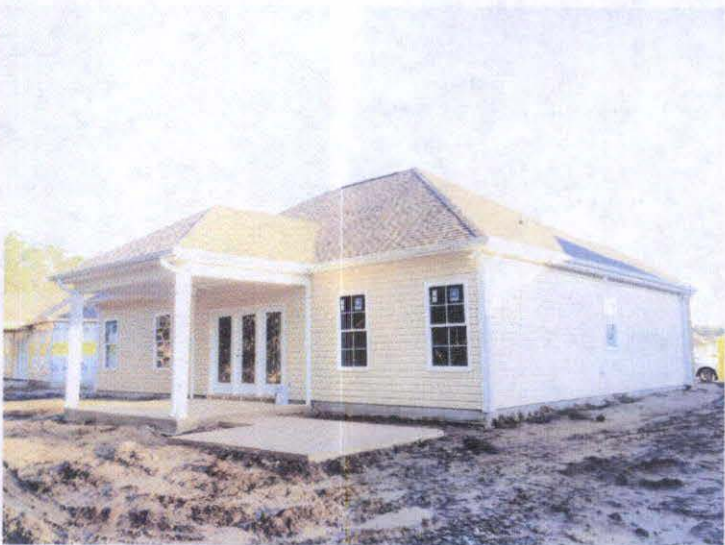
Rear View 01/21/15