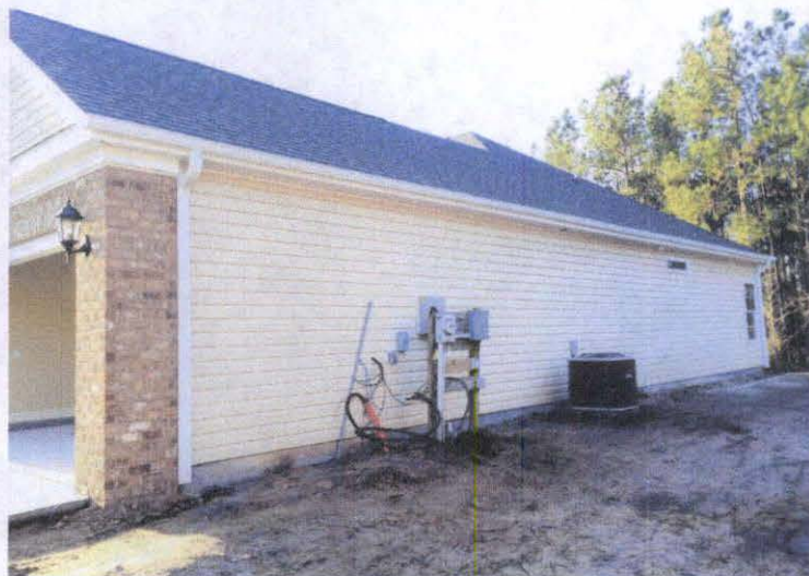
Right Side View 01/21/15