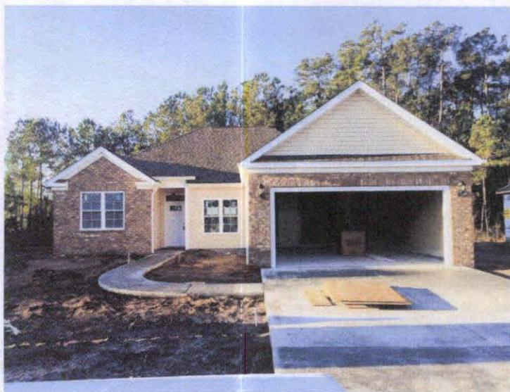
Front View 01/21/15

If using the Elevation Certificate to obtain NFIP flood insurance, affix at least 2 building photographs below according to the instructions for Item A6. Identify all photographs with date taken; "Front View" and "Rear View"; and, if required, "Right Side View" and "Left Side View." When applicable, photographs must show the foundation with representative examples of the flood openings or vents, as indicated in Section A8. If submitting more photographs than will fit on this page, use the Continuation Page.