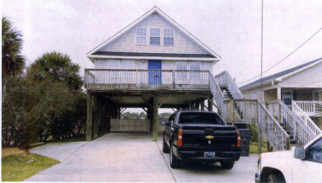
FRONT SIDE (STREET VIEW) TAKEN 1/26/2016

If using the Elevation Certificate to obtain NFIP flood insurance, affix at least 2 building photographs below according to the instructions for Item A6. Identify all photographs with date taken; "Front view" and Rear view"; and, if required, "Right Side View" and "Left Side View." When applicable, photographs must show the foundation with representative examples of the flood openings or vents, as indicated in Section A8. If submitting more photographs than will fit on this page, use the Continuation Page.