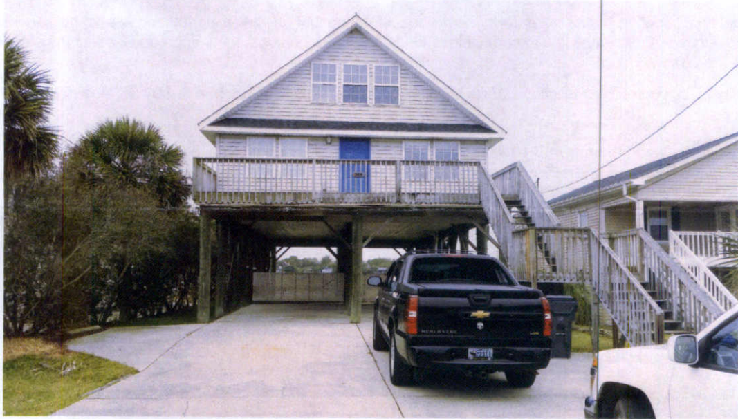
FRONT SIDE (STREET VIEW) TAKEN 1/26/2016

If using the Elevation Certificate to obtain NFIP flood insurance, affix at least 2 building photographs below according to the instructions for Item A6. Identify all photographs with date taken; "Front view" and Rear view"; and, if required, "Right Side View" and "Left Side View." When applicable, photographs must show the foundation with representative examples of the flood openings or vents, as indicated in Section A8. If submitting more photographs than will fit on this page, use the Continuation Page.