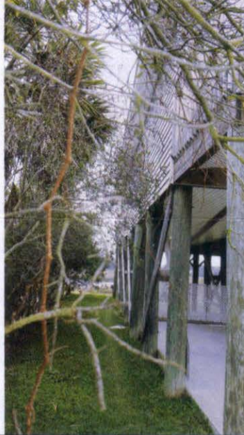
RIGHT SIDE TAKEN 1/26/2016

If submitting more photographs than will fit on the preceding page, affix the additional photographs below. Identify all photographs with: date taken; "Front View" and "Rear View" and, if required, "Right Side View" and "Left Side View." When applicable, photographs must show the foundation with representative examples of the flood openings or vents, as indicated in Section A8.