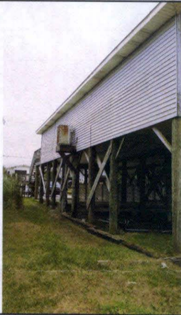
LEFT SIDE TAKEN 1/26/2016