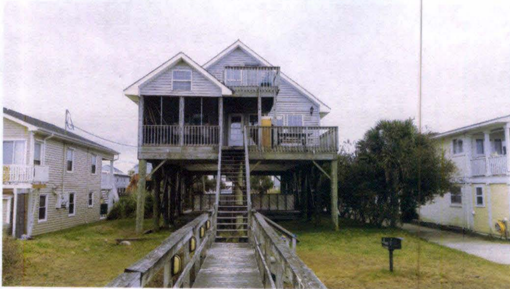
REAR SIDE TAKEN 1/26/2016