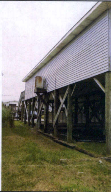
LEFT SIDE TAKEN 1/26/2016