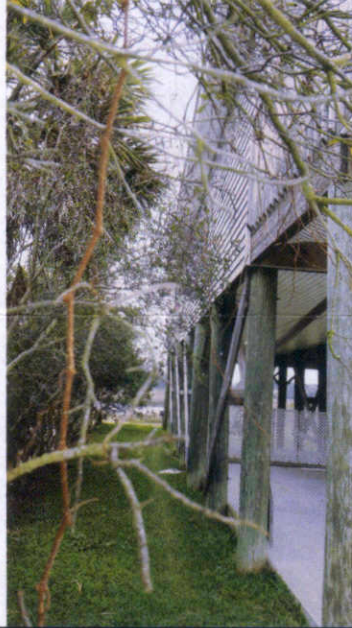
RIGHT SIDE TAKEN 1/26/2016

If submitting more photographs than will fit on the preceding page, affix the additional photographs below. Identify all photographs with: date taken; "Front View" and "Rear View" and, if required, "Right Side View" and "Left Side View." When applicable, photographs must show the foundation with representative examples of the flood openings or vents, as indicated in Section A8.