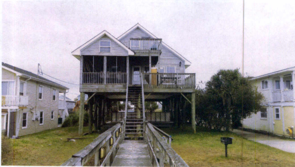
REAR SIDE TAKEN 1/26/2016