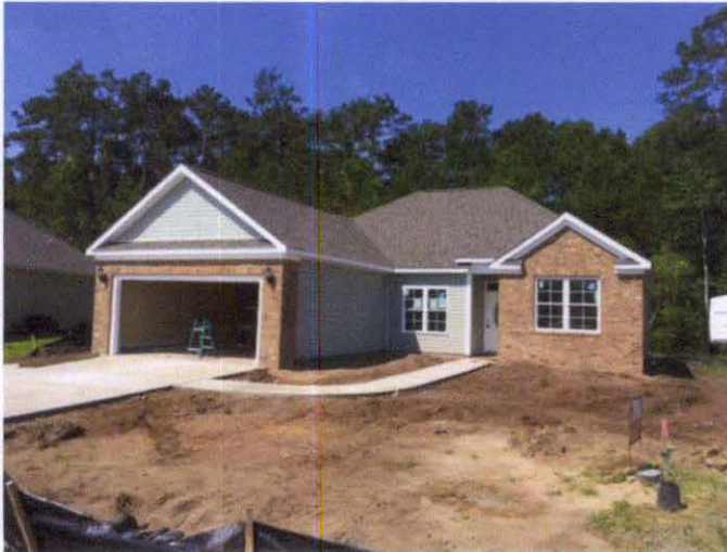
Front View (6/23/15)

If using the Elevation Certificate to obtain NFIP flood insurance, affix at least 2 building photographs below according to the instructions for Item A6. Identify all photographs with date taken; "Front View" and "Rear View"; and, if required, "Right Side View" and "Left Side View." When applicable, photographs must show the foundation with representative examples of the flood openings or vents, as indicated in Section A8. If submitting more photographs than will fit on this page, use the Continuation Page.