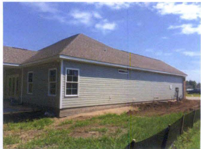
Left Side View (6/23/15)