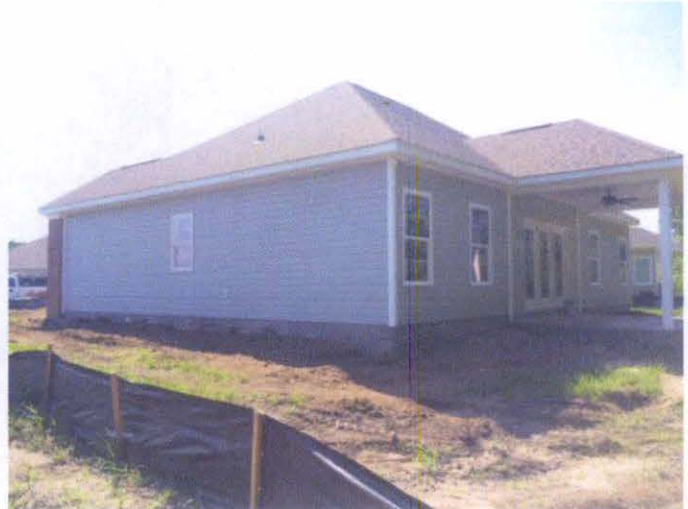
Right Side View (6/23/15)