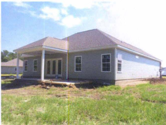
Rear View (6/23/15)