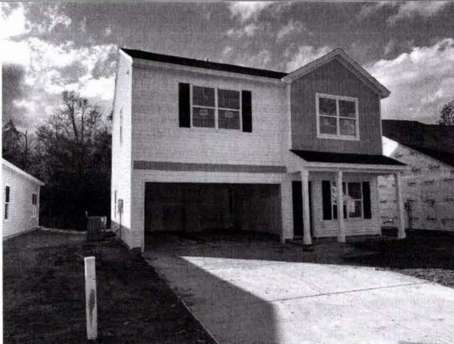
Photo One Caption Front View; 10-26-2022

If using the Elevation Certificate to obtain NFIP flood insurance, affix at least 2 building photographs below according to the instructions for Item A6. Identify all photographs with date taken; "Front View" and "Rear View"; and, if required, "Right Side View" and "Left Side View." When applicable, photographs must show the foundation with representative examples of the flood openings or vents, as indicated in Section A8. If submitting more photographs than will fit on this page, use the Continuation Page.