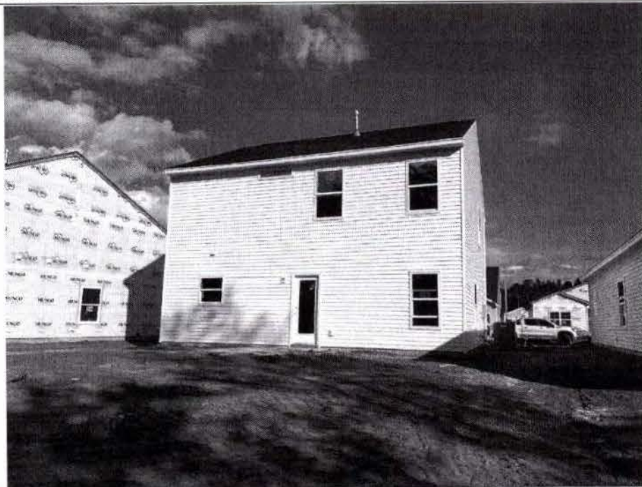
Photo Two Caption Rear View; 10-26-2022