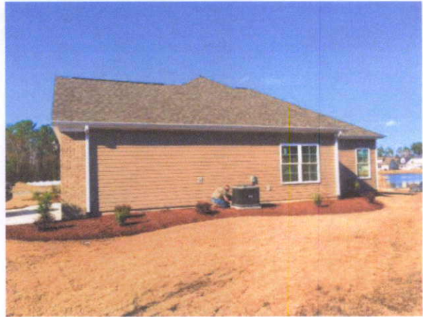
Right Side View (02/29/16)