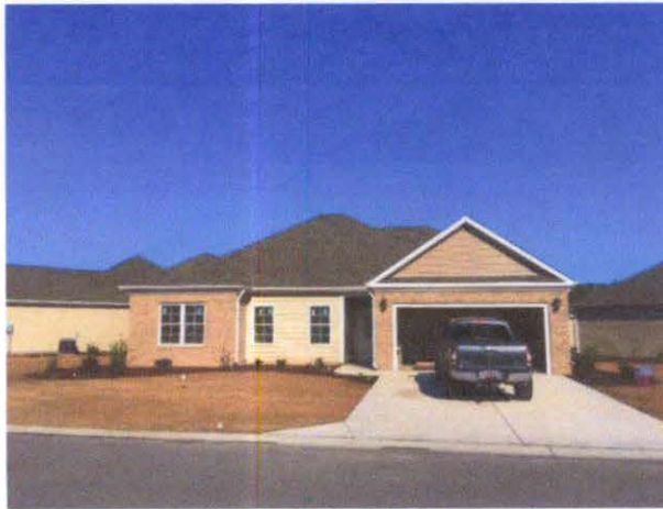
Front View (02/29/16)

If using the Elevation Certificate to obtain NFIP flood insurance, affix at least 2 building photographs below according to the instructions for Item A6. Identify all photographs with date taken; "Front View" and "Rear View"; and, if required, "Right Side View" and "Left Side View." When applicable, photographs must show the foundation with representative examples of the flood openings or vents, as indicated in Section A8. If submitting more photographs than will fit on this page, use the Continuation Page.