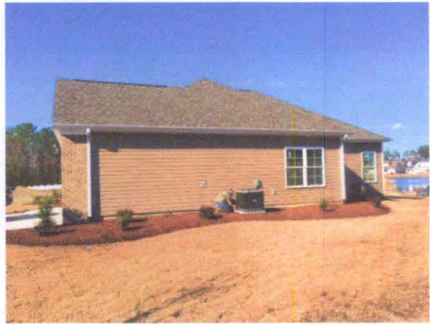
Right Side View (02/29/16)