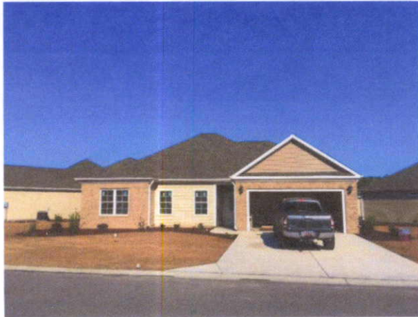
Front View (02/29/16)

If using the Elevation Certificate to obtain NFIP flood insurance, affix at least 2 building photographs below according to the instructions for Item A6. Identify all photographs with date taken; "Front View" and "Rear View"; and, if required, "Right Side View" and "Left Side View." When applicable, photographs must show the foundation with representative examples of the flood openings or vents, as indicated in Section A8. If submitting more photographs than will fit on this page, use the Continuation Page.