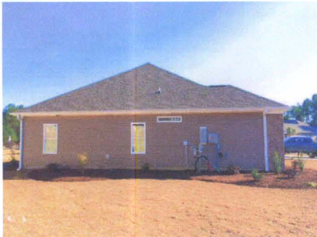
Left Side View (02/29/16)