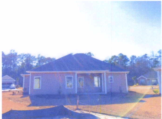
Rear View (02/29/16)