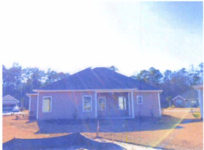
Rear View (02/29/16)