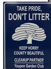
A pristine scene from Vereen Gardens