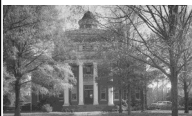
The Horry County Board of Architectural Review