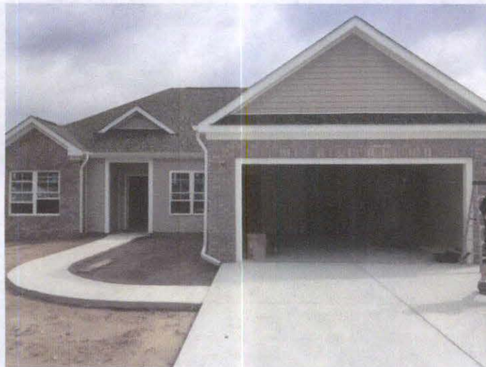
Front View 08/07/15

If using the Elevation Certificate to obtain NFIP flood insurance, affix at least 2 building photographs below according to the instructions for Item A6. Identify all photographs with date taken; "Front View" and "Rear View"; and, if required, "Right Side View" and "Left Side View." When applicable, photographs must show the foundation with representative examples of the flood openings or vents, as indicated in Section A8. If submitting more photographs than will fit on this page, use the Continuation Page.