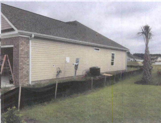
Right Side View 08/07/15