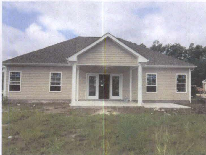
Rear View 08/07/15