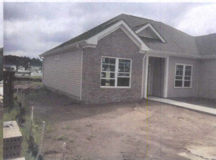
Left Side View 08/07/15