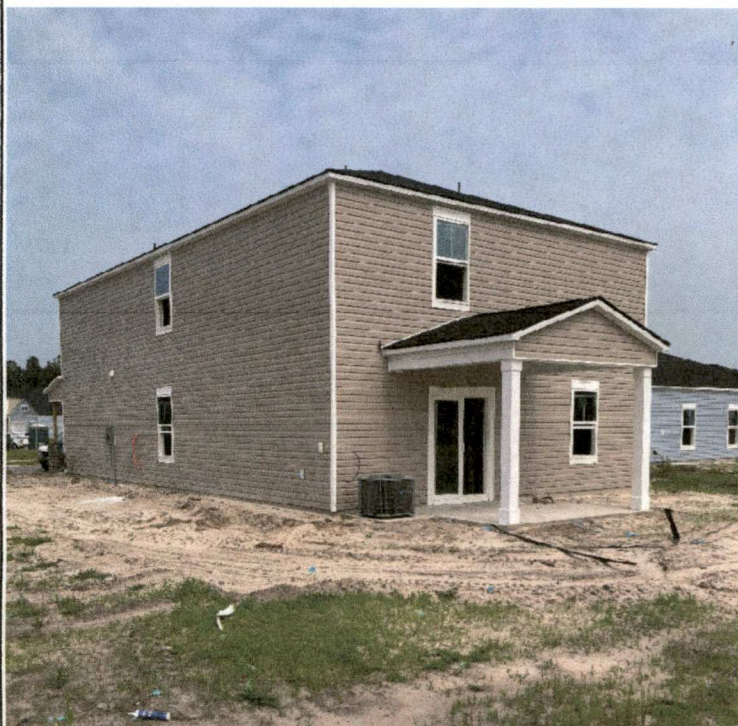
REAR RIGHT VIEW 06/30/2023

If submitting more photographs than will fit on the preceding page, affix the additional photographs below. Identify all photographs with: date taken; "Front View" and "Rear View"; and, if required, "Right Side View" and "Left Side View." When applicable, photographs must show the foundation with representative examples of the flood openings or vents, as indicated in Section A8.