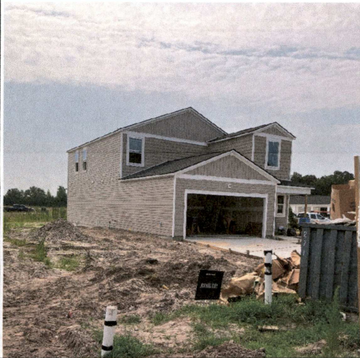
FRONT LEFT VIEW 06/30/2023

If using the Elevation Certificate to obtain NFIP flood insurance, affix at least 2 building photographs below according to the instructions for Item A6. Identify all photographs with date taken; "Front View" and "Rear View"; and, if required, "Right Side View" and "Left Side View." When applicable, photographs must show the foundation with representative examples of the flood openings or vents, as indicated in Section A8. If submitting more photographs than will fit on this page, use the Continuation Page.