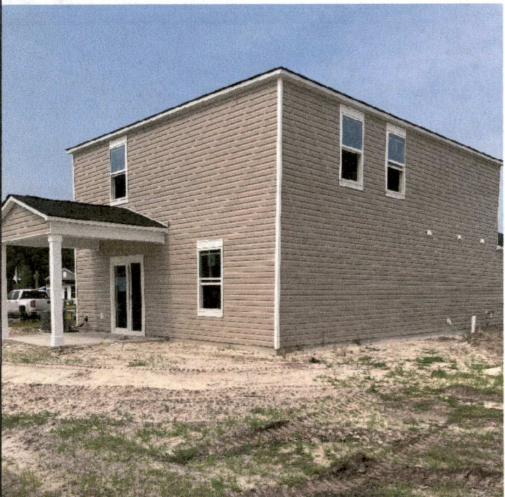
REAR LEFT VIEW 06/30/2023