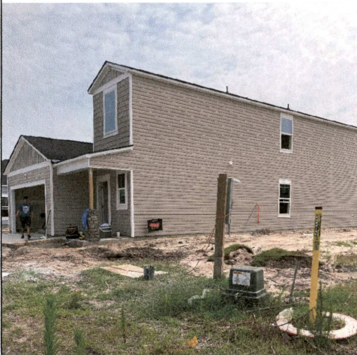
FRONT RIGHT VIEW 06/30/2023