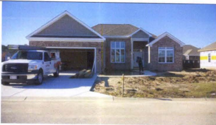
Front View (11/23/15)

If using the Elevation Certificate to obtain NFIP flood insurance, affix at least 2 building photographs below according to the instructions for Item A6. Identify all photographs with date taken; "Front View" and "Rear View"; and, if required, "Right Side View" and "Left Side View." When applicable, photographs must show the foundation with representative examples of the flood openings or vents, as indicated in Section A8. If submitting more photographs than will fit on this page, use the Continuation Page.