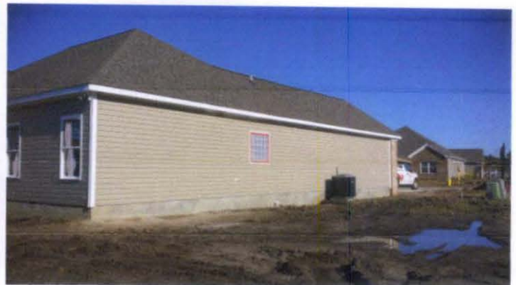
Left Side View (11/23/15)