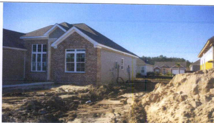
Right Side View (11/23/15)