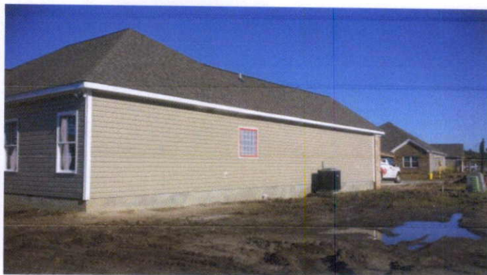
Left Side View (11/23/15)