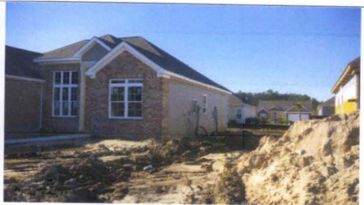
Right Side View (11/23/15)