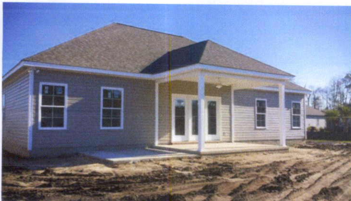
Rear View (11/23/15)