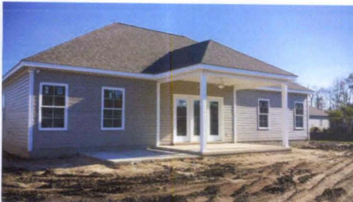
Rear View (11/23/15)