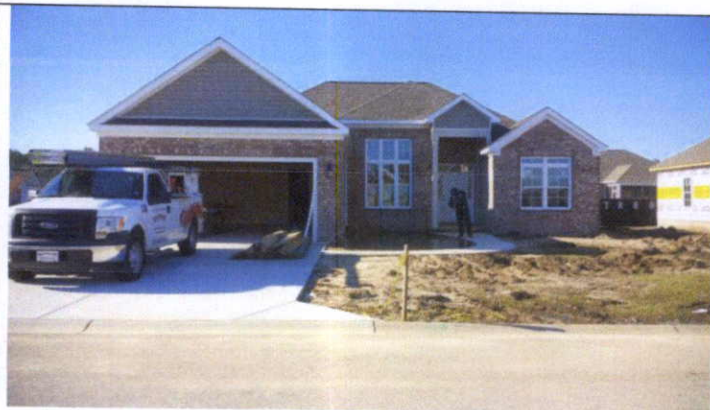
Front View (11/23/15)

If using the Elevation Certificate to obtain NFIP flood insurance, affix at least 2 building photographs below according to the instructions for Item A6. Identify all photographs with date taken; "Front View" and "Rear View"; and, if required, "Right Side View" and "Left Side View." When applicable, photographs must show the foundation with representative examples of the flood openings or vents, as indicated in Section A8. If submitting more photographs than will fit on this page, use the Continuation Page.