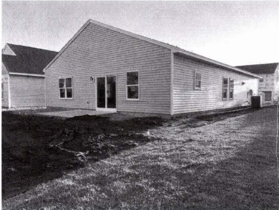
Photo Two Caption Rear View; 10-18-2022