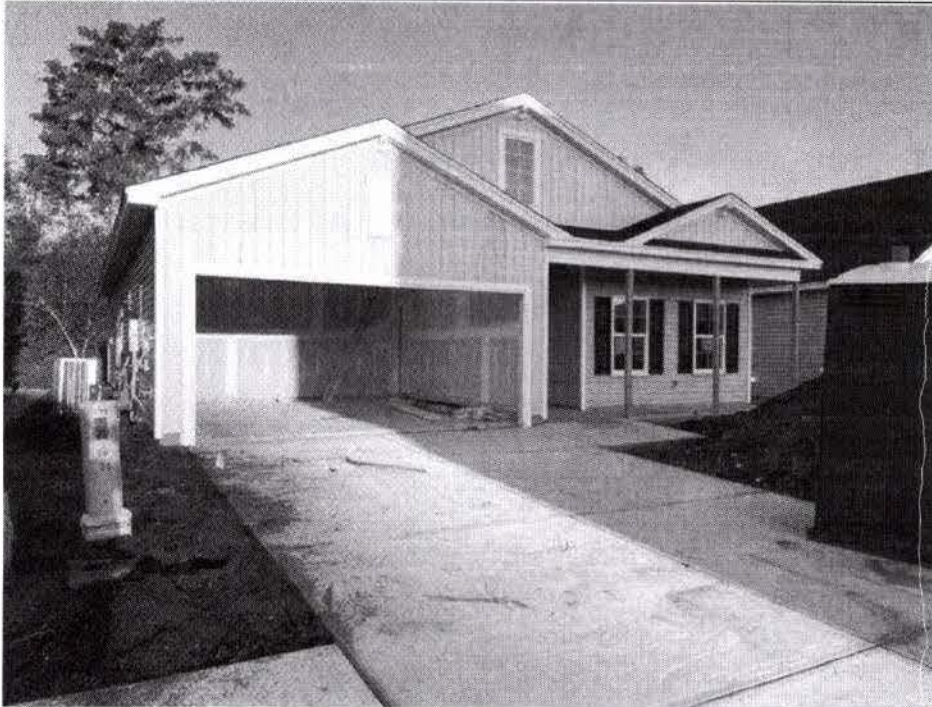
Photo One Caption Front View; 10-18-2022

If using the Elevation Certificate to obtain NFIP flood insurance, affix at least 2 building photographs below according to the instructions for Item A6. Identify all photographs with date taken; "Front View" and "Rear View"; and, if required, "Right Side View" and "Left Side View." When applicable, photographs must show the foundation with representative examples of the flood openings or vents, as indicated in Section A8. If submitting more photographs than will fit on this page, use the Continuation Page.