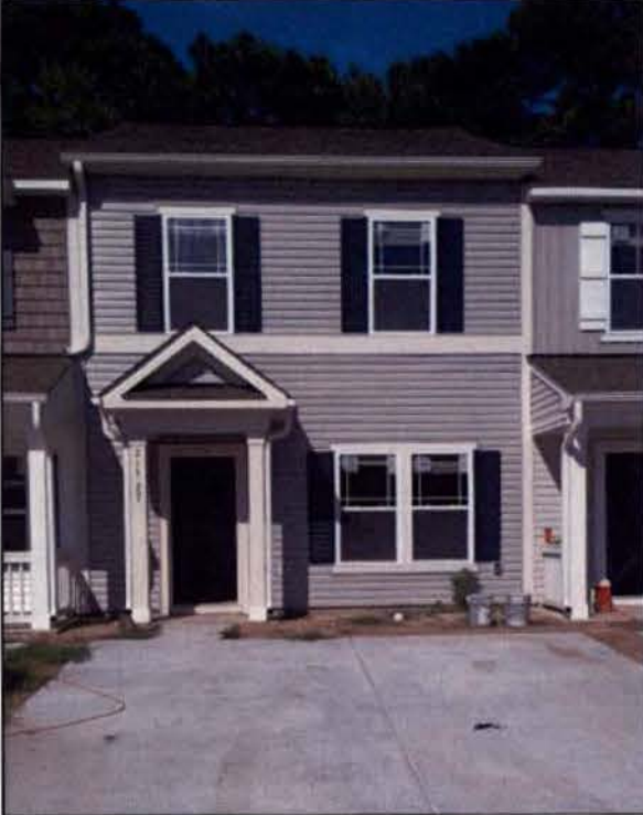
FRONT VIEW 07/06/2022

If using the Elevation Certificate to obtain NFIP flood insurance, affix at least 2 building photographs below according to the instructions for Item A6. Identify all photographs with date taken; "Front View" and "Rear View"; and, if required, "Right Side View" and "Left Side View." When applicable, photographs must show the foundation with representative examples of the flood openings or vents, as indicated in Section A8. If submitting more photographs than will fit on this page, use the Continuation Page.