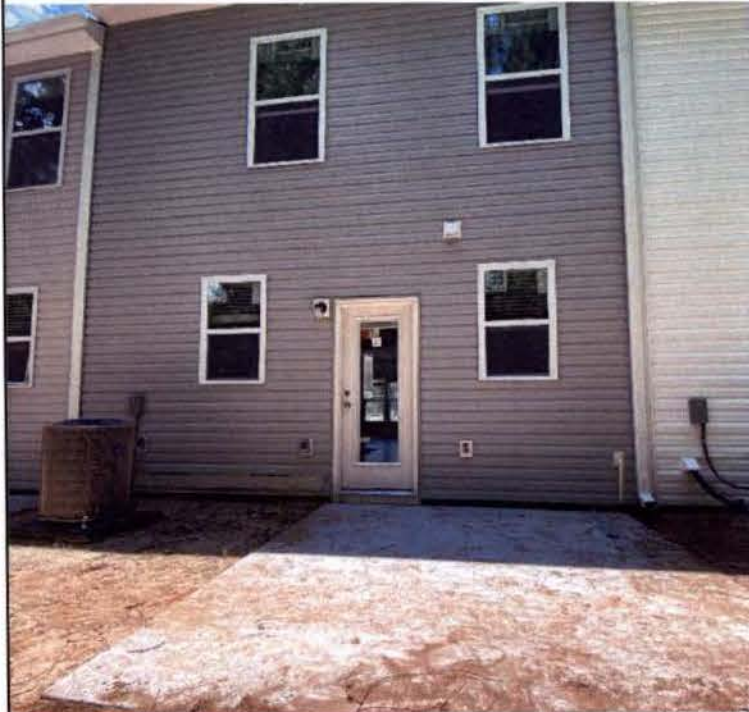
REAR VIEW 07/06/2022