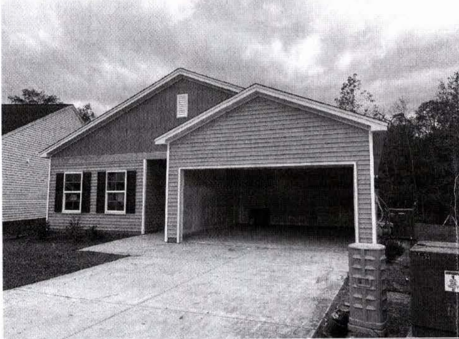
Photo One Caption Front View; 11-22-2022

If using the Elevation Certificate to obtain NFIP flood insurance, affix at least 2 building photographs below according to the instructions for Item A6. Identify all photographs with date taken; "Front View" and "Rear View"; and, if required, "Right Side View" and "Left Side View." When applicable, photographs must show the foundation with representative examples of the flood openings or vents, as indicated in Section A8. If submitting more photographs than will fit on this page, use the Continuation Page.