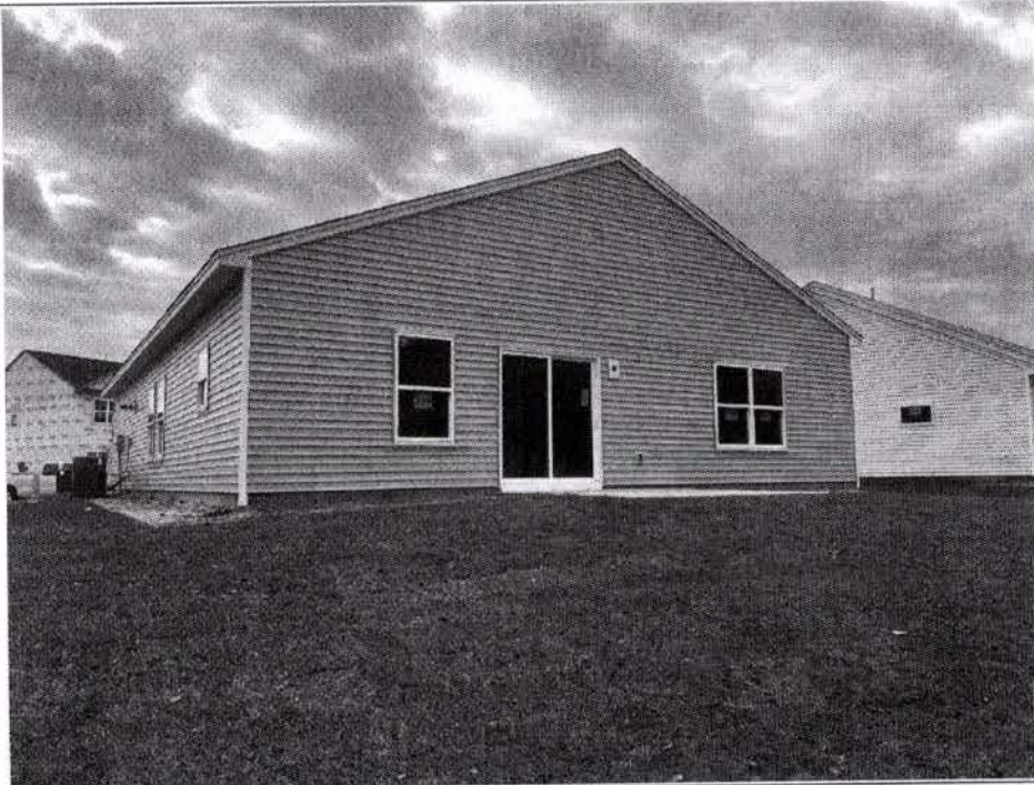
Photo Two Caption Rear View; 11-22-2022