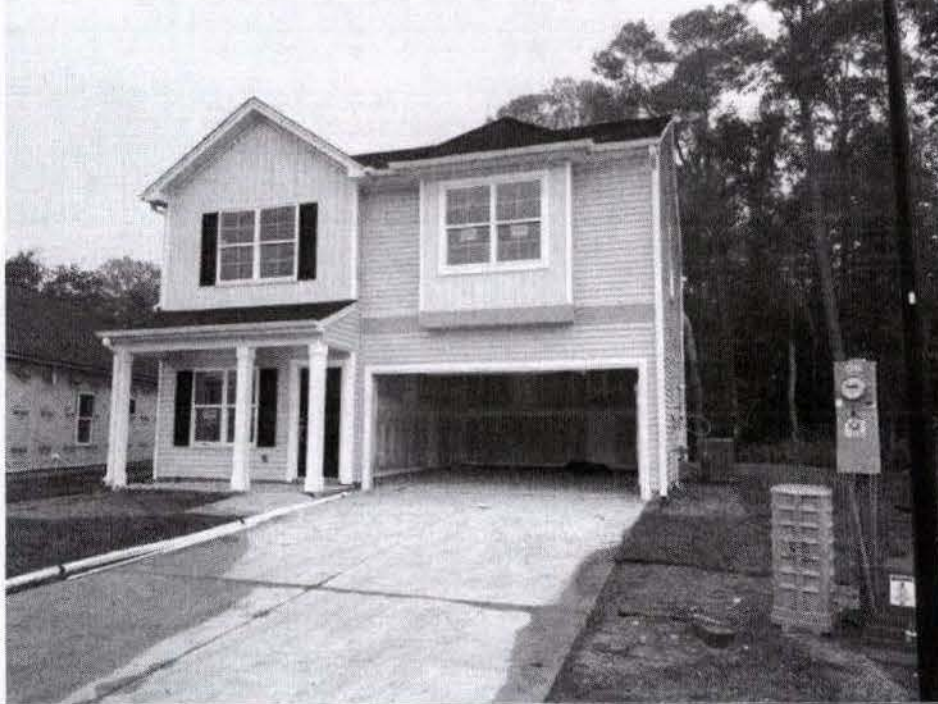
Photo One Caption Front View; 10-25-2022

If using the Elevation Certificate to obtain NFIP flood insurance, affix at least 2 building photographs below according to the instructions for Item A6. Identify all photographs with date taken; "Front View" and "Rear View"; and, if required, "Right Side View" and "Left Side View." When applicable, photographs must show the foundation with representative examples of the flood openings or vents, as indicated in Section A8. If submitting more photographs than will fit on this page, use the Continuation Page.