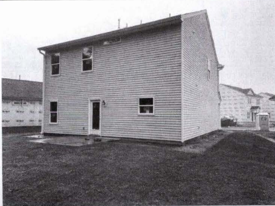
Photo Two Caption Rear View; 10-25-2022