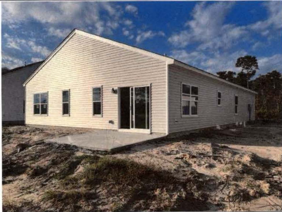
Photo Two Caption Rear View; 10-11-2022