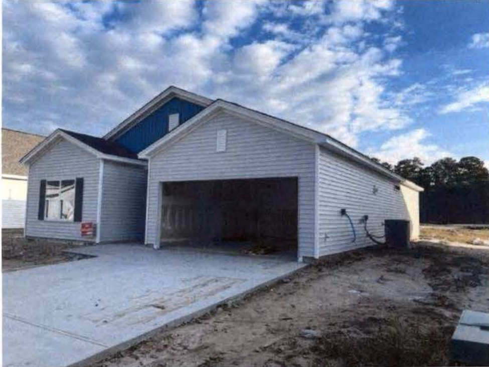
Photo One Caption Front View; 10-11-2022

If using the Elevation Certificate to obtain NFIP flood insurance, affix at least 2 building photographs below according to the instructions for Item A6. Identify all photographs with date taken; "Front View" and "Rear View"; and, if required, "Right Side View" and "Left Side View." When applicable, photographs must show the foundation with representative examples of the flood openings or vents, as indicated in Section A8. If submitting more photographs than will fit on this page, use the Continuation Page.