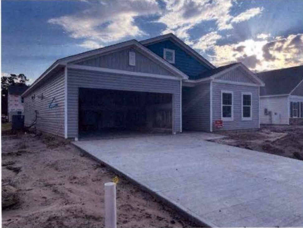
Photo One Caption Front View; 10-11-2022

If using the Elevation Certificate to obtain NFIP flood insurance, affix at least 2 building photographs below according to the instructions for Item A6. Identify all photographs with date taken; "Front View" and "Rear View"; and, if required, "Right Side View" and "Left Side View." When applicable, photographs must show the foundation with representative examples of the flood openings or vents, as indicated in Section A8. If submitting more photographs than will fit on this page, use the Continuation Page.