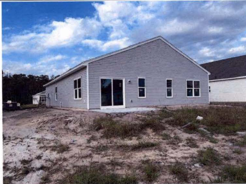
Photo Two Caption Rear View; 10-11-2022