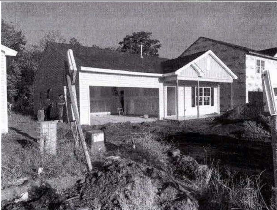
Photo One Caption Front View; 09-21-2022

If using the Elevation Certificate to obtain NFIP flood insurance, affix at least 2 building photographs below according to the instructions for Item A6. Identify all photographs with date taken; "Front View" and "Rear View"; and, if required, "Right Side View" and "Left Side View." When applicable, photographs must show the foundation with representative examples of the flood openings or vents, as indicated in Section A8. If submitting more photographs than will fit on this page, use the Continuation Page.