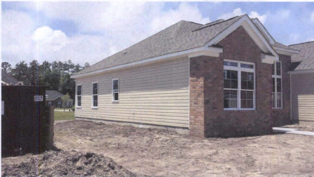
Left-Side View 05/26/15