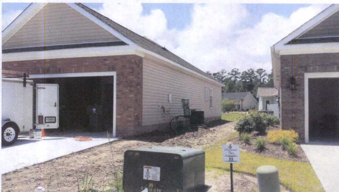
Right-Side View 05/26/15