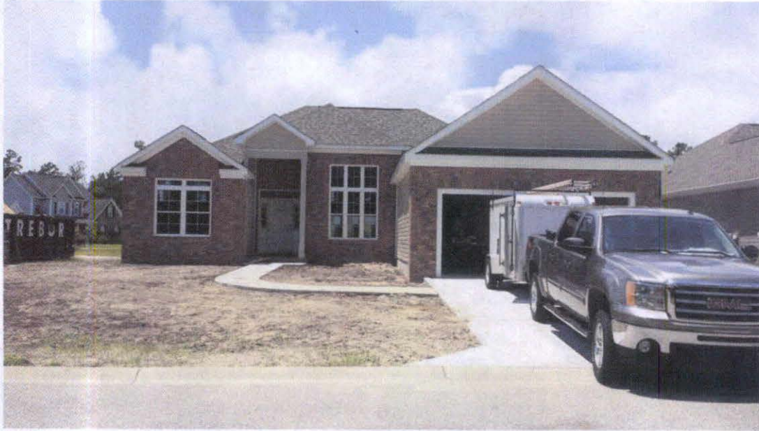
Front View 05/26/15

If using the Elevation Certificate to obtain NFIP flood insurance, affix at least 2 building photographs below according to the instructions for Item A6. Identify all photographs with date taken; "Front View" and "Rear View"; and, if required, "Right Side View" and "Left Side View." When applicable, photographs must show the foundation with representative examples of the flood openings or vents, as indicated in Section A8. If submitting more photographs than will fit on this page, use the Continuation Page.