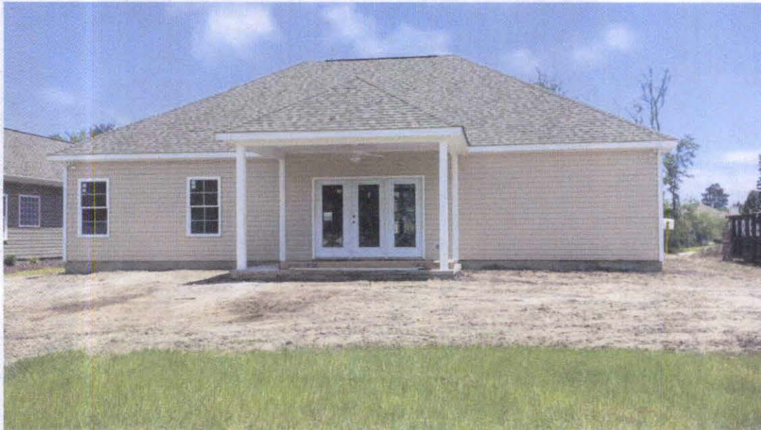
Rear View 05/26/15

If submitting more photographs than will fit on the preceding page, affix the additional photographs below. Identify all photographs with: date taken; "Front View" and "Rear View"; and, if required, "Right Side View" and "Left Side View." When applicable, photographs must show the foundation with representative examples of the flood openings or vents, as indicated in Section A8.