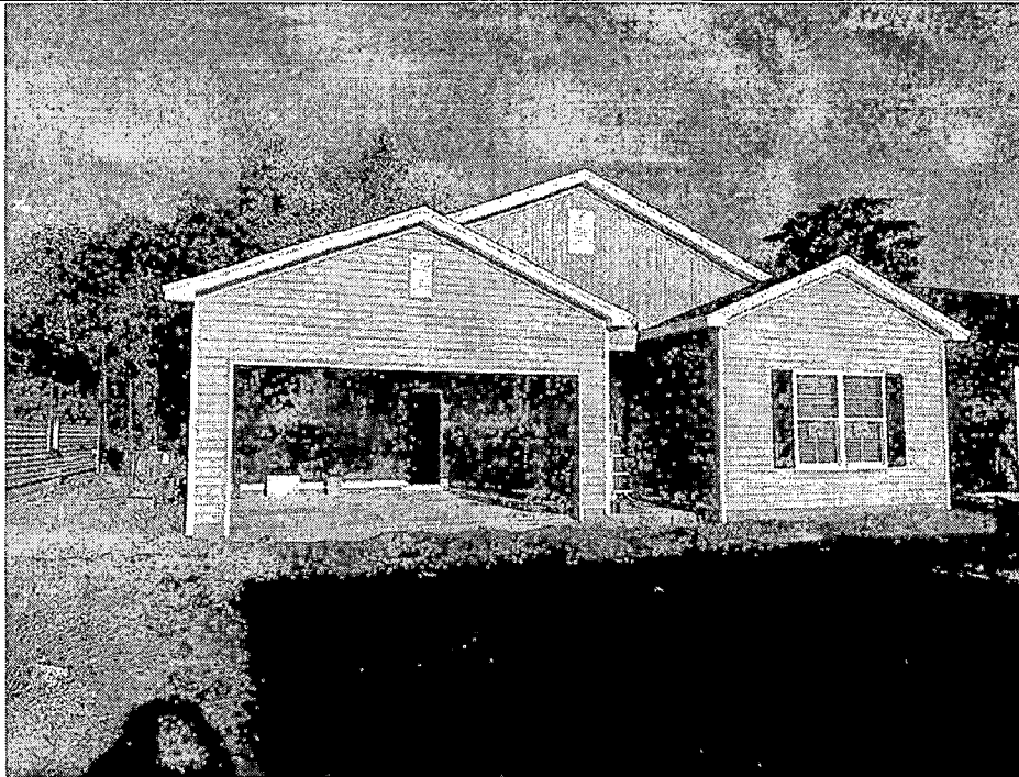
Photo One Caption Front View; 09-21-2022

If using the Elevation Certificate to obtain NFIP flood insurance, affix at least 2 building photographs below according to the instructions for Item A6. Identify all photographs with date taken; "Front View" and "Rear View"; and, if required, "Right Side View" and "Left Side View." When applicable, photographs must show the foundation with representative examples of the flood openings or vents, as indicated in Section A8. If submitting more photographs than will fit on this page, use the Continuation Page.