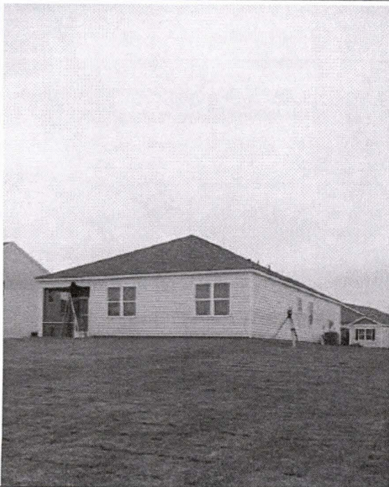
REAR LEFT VIEW 12/20/2022