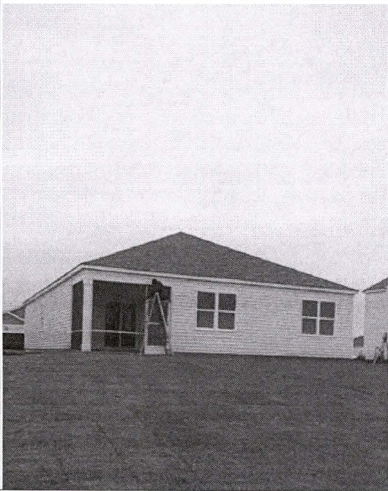
REAR RIGHT VIEW 12/20/2022

If submitting more photographs than will fit on the preceding page, affix the additional photographs below. Identify all photographs with: date taken; "Front View" and "Rear View"; and, if required, "Right Side View" and "Left Side View." When applicable, photographs must show the foundation with representative examples of the flood openings or vents, as indicated in Section A8.