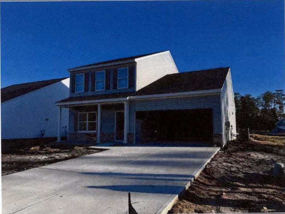
Photo One Caption Front View; 11-28-2022

If using the Elevation Certificate to obtain NFIP flood insurance, affix at least 2 building photographs below according to the instructions for Item A6. Identify all photographs with date taken; "Front View" and "Rear View"; and, if required, "Right Side View" and "Left Side View." When applicable, photographs must show the foundation with representative examples of the flood openings or vents, as indicated in Section A8. If submitting more photographs than will fit on this page, use the Continuation Page.