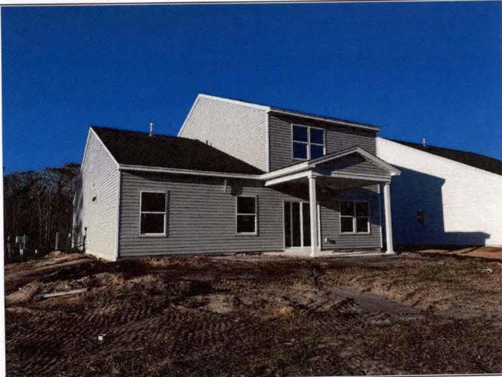
Photo Two Caption Rear View; 11-28-2022