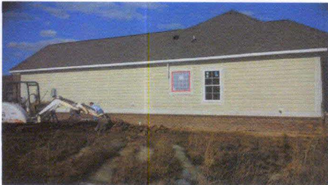
Right Side View (02-17-16)