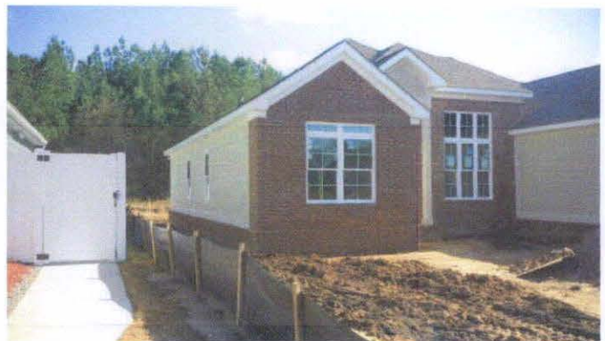
Left Side View (02-17-16)