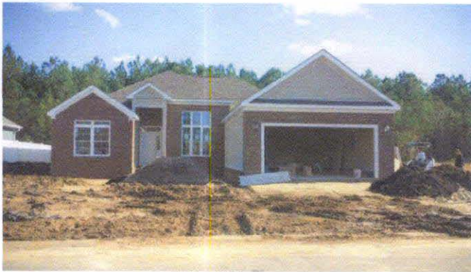
Front View (02-17-16)

If using the Elevation Certificate to obtain NFIP flood insurance, affix at least 2 building photographs below according to the instructions for Item A6. Identify all photographs with date taken; "Front View" and "Rear View"; and, if required, "Right Side View" and "Left Side View." When applicable, photographs must show the foundation with representative examples of the flood openings or vents, as indicated in Section A8. If submitting more photographs than will fit on this page, use the Continuation Page.