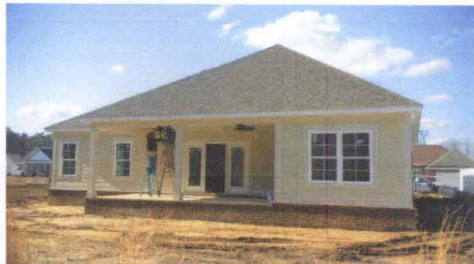
Rear View (02-17-16)