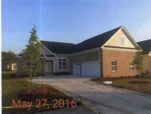
Front Left Side

If using the Elevation Certificate to obtain NFIP flood insurance, affix at least 2 building photographs below according to the instructions for Item A6. Identify all photographs with date taken; "Front view" and "Rear view"; and, if required, "Right Side View" and "Left Side View." When applicable, photographs must show the foundation with representative examples of the flood openings or vents, as indicated in Section A8. If submitting more photographs than will fit on this page, use the Continuation Page.