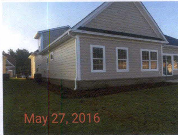
Rear Right Side HVAC