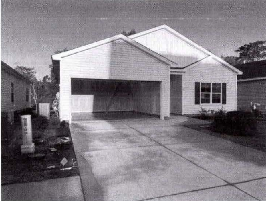
Photo One Caption Front View; 10-18-2022

If using the Elevation Certificate to obtain NFIP flood insurance, affix at least 2 building photographs below according to the instructions for Item A6. Identify all photographs with date taken; "Front View" and "Rear View"; and, if required, "Right Side View" and "Left Side View." When applicable, photographs must show the foundation with representative examples of the flood openings or vents, as indicated in Section A8. If submitting more photographs than will fit on this page, use the Continuation Page.