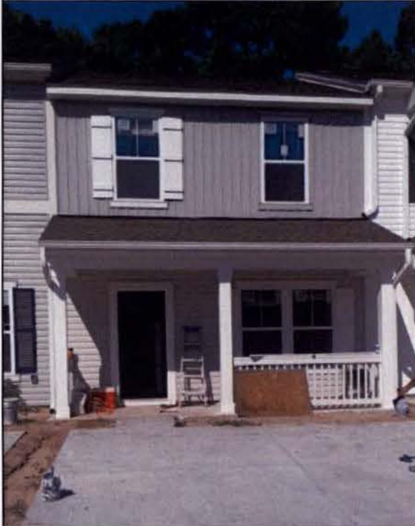
FRONT VIEW 07/06/2022

If using the Elevation Certificate to obtain NFIP flood insurance, affix at least 2 building photographs below according to the instructions for Item A6. Identify all photographs with date taken; "Front View" and "Rear View"; and, if required, "Right Side View" and "Left Side View." When applicable, photographs must show the foundation with representative examples of the flood openings or vents, as indicated in Section A8. If submitting more photographs than will fit on this page, use the Continuation Page.