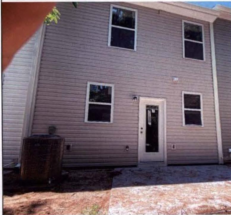
REAR VIEW 07/06/2022