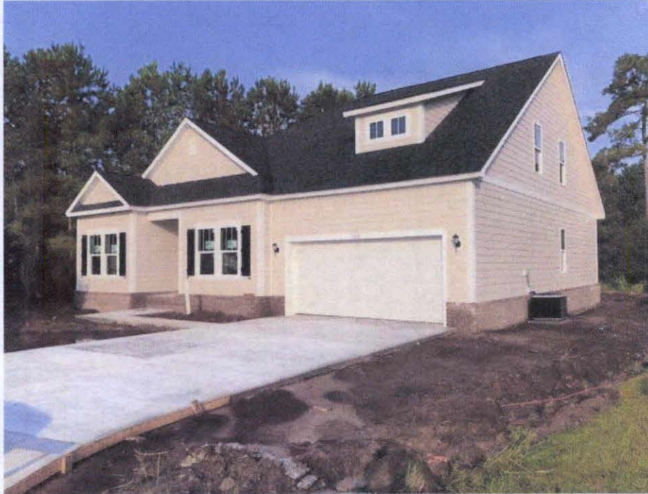
Photo One Caption Front View

If using the Elevation Certificate to obtain NFIP flood insurance, affix at least 2 building photographs below according to the instructions for Item A6. Identify all photographs with date taken; "Front View" and "Rear View"; and, if required, "Right Side View" and "Left Side View." When applicable, photographs must show the foundation with representative examples of the flood openings or vents, as indicated in Section A8. If submitting more photographs than will fit on this page, use the Continuation Page.