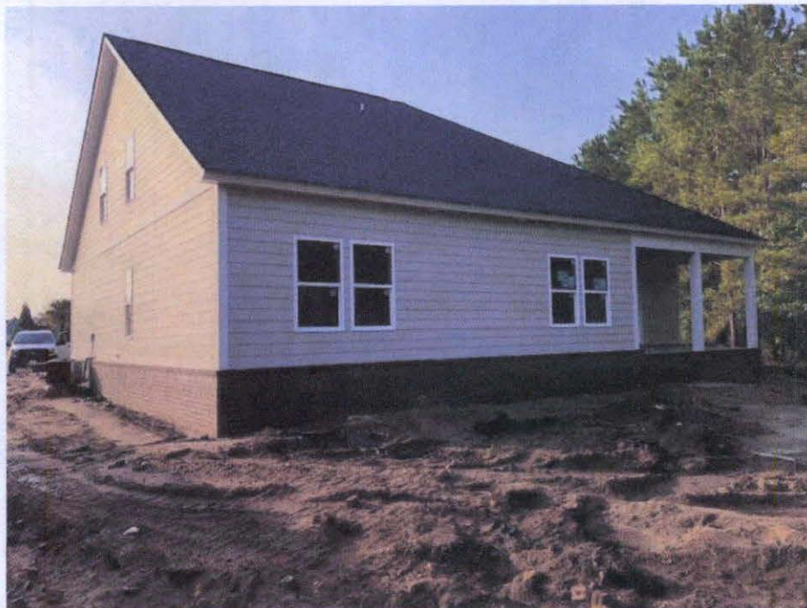
Photo Two Caption Rear View