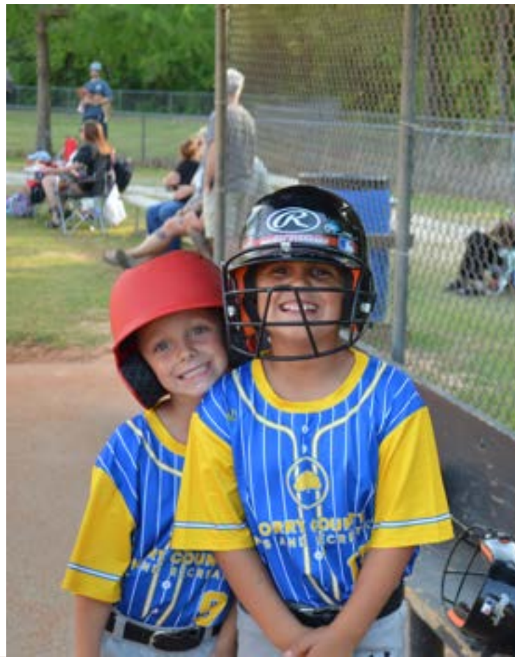
North Strand T-Ball