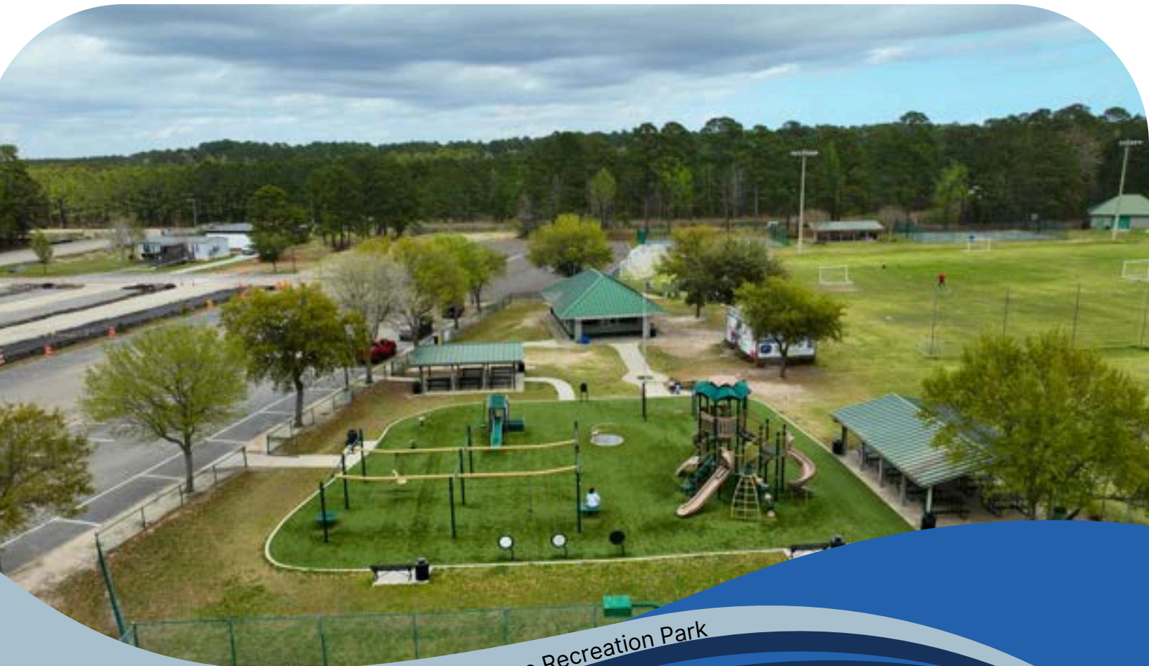
Socastee Recreation Park