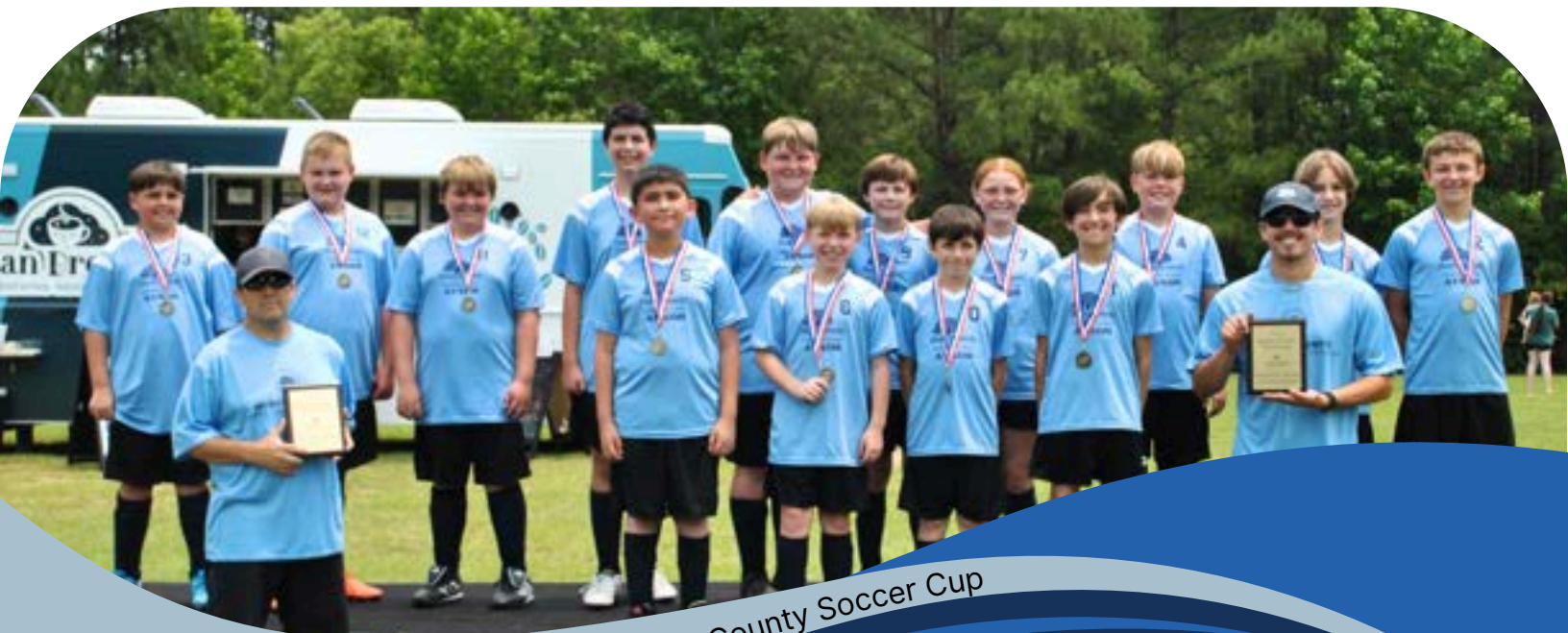
Horry County Soccer Cup