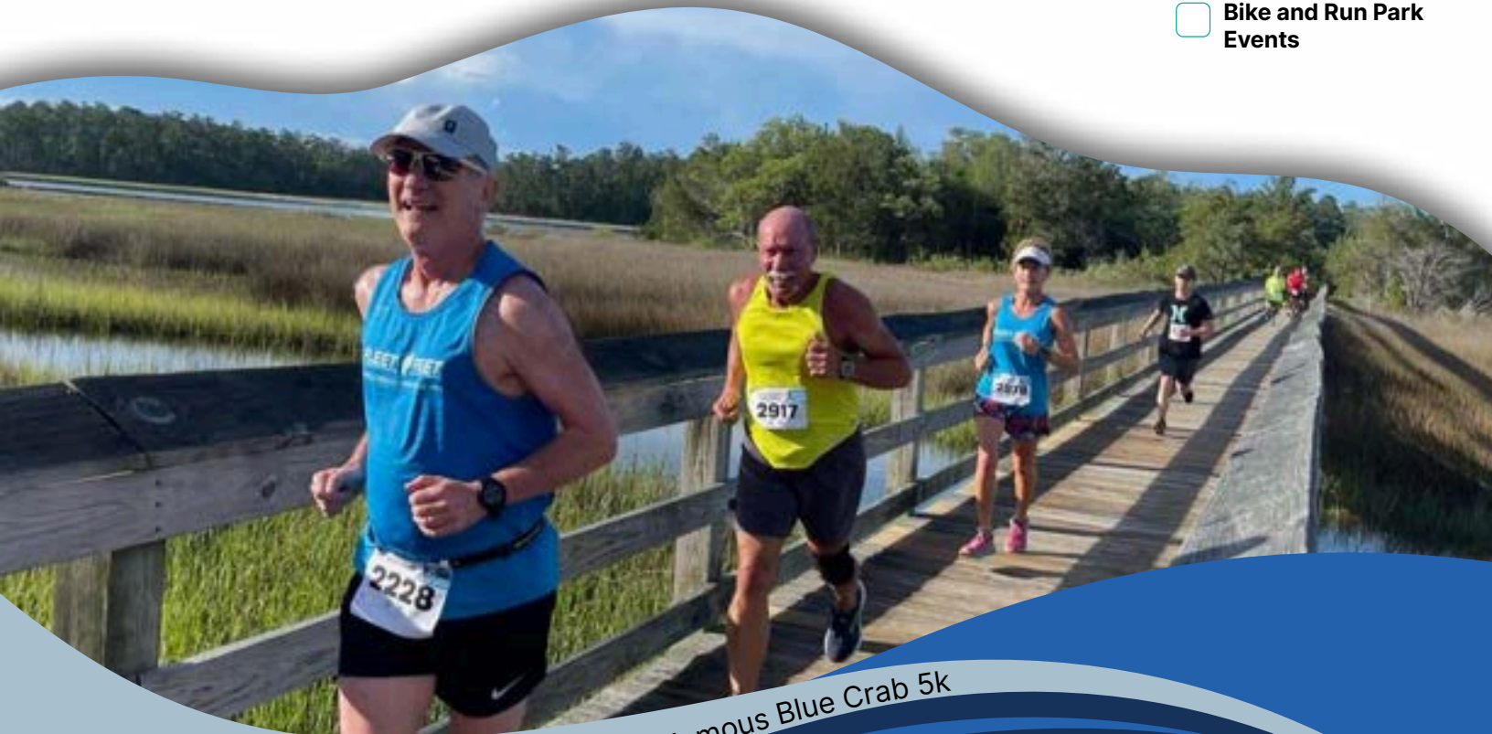
World Famous Blue Crab 5k